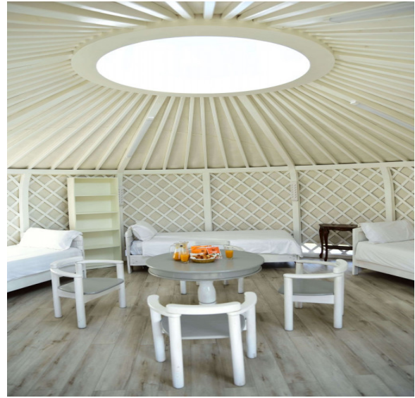
Pic 2 Inside of Ger

On the way to Khaan Jims camp, we will visit two sightseeing places: Tonyukuk monument complex and Chinggis Khan Statue Complex .