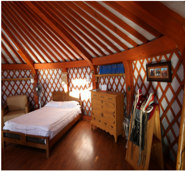
Pic 1 Inside of Ger