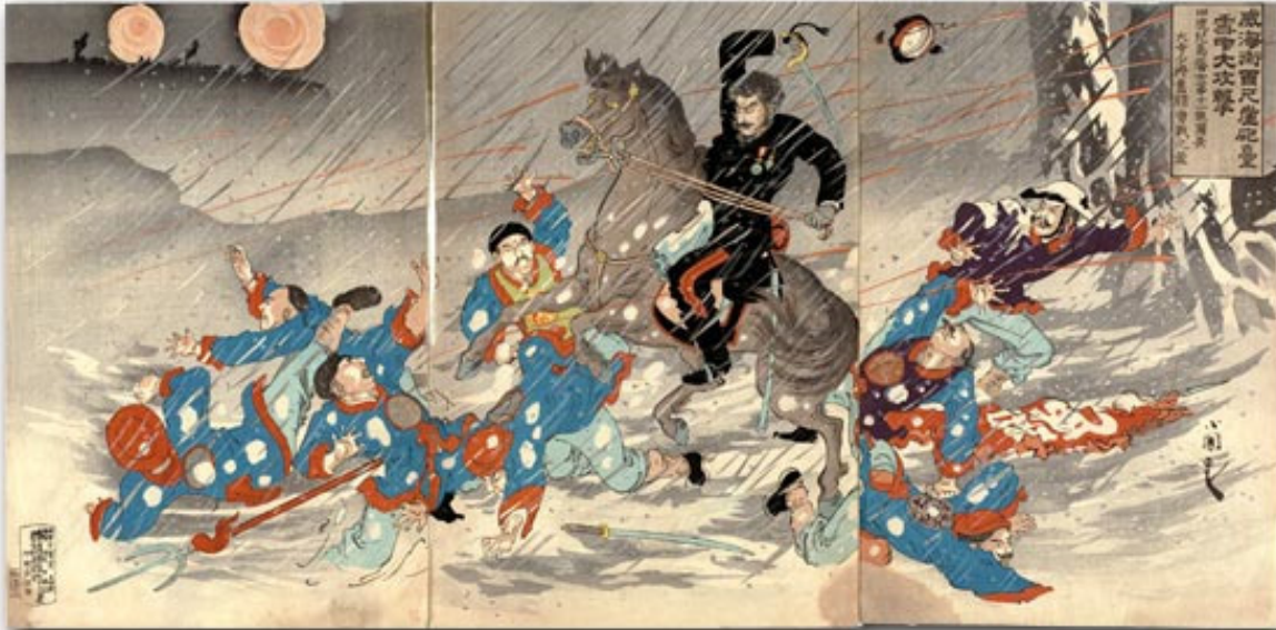
“Great Attack in Snow at Fort of One-Hundred-Foot Cliff Near Weihaiwei: Illustration of Major General Odera’s Desperate Fight - Commander of the 11th Brigade” by Utagawa Kokunimasa, February 1895

[2000.102] Sharf Collection, Museum of Fine Arts, Boston