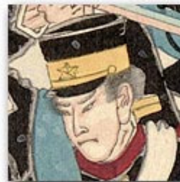
“Great Rear Attack by Our Second Army at Weihaiwei,” artist unknown, February 1895 (with details of Chinese, left, and Japanese, right)

[2000.113] Sharf Collection, Museum of Fine Arts, Boston