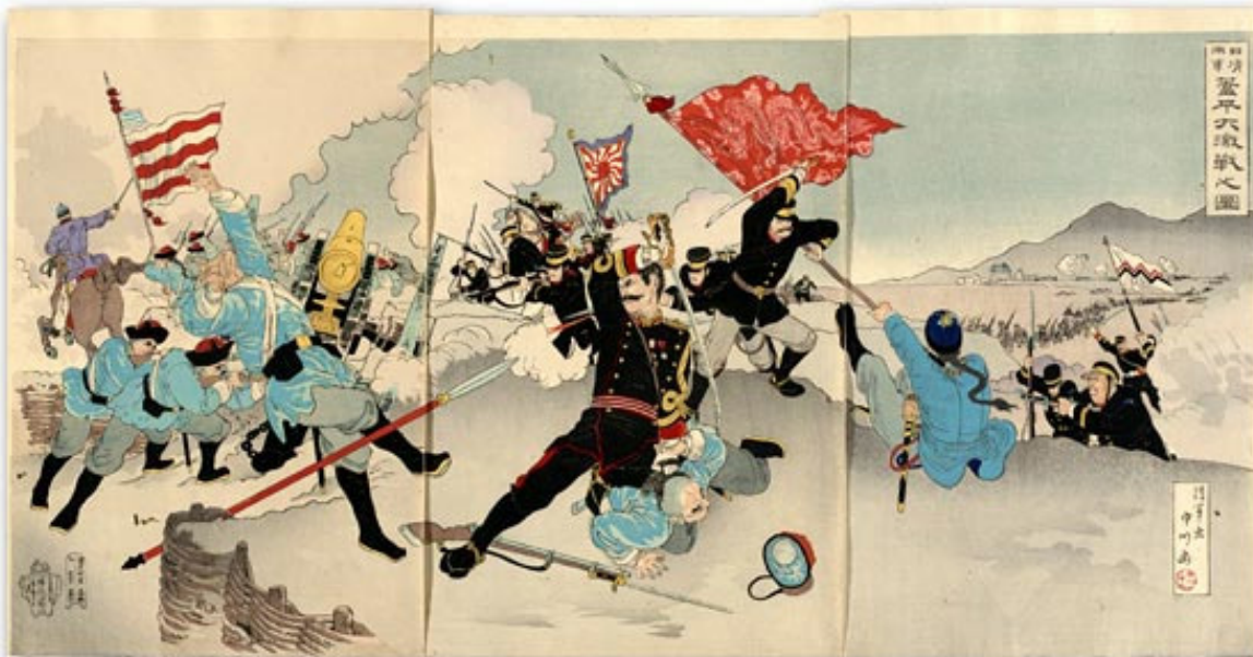
“Chinese and Japanese Troops: Picture of a Fierce Battle at Gaiping” by Nakagawa, February 1895

[2000.102] Sharf Collection, Museum of Fine Arts, Boston