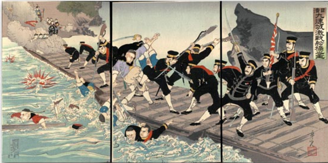
“Sino-Japanese War: The Fierce Battle on the Floating Bridge at Jiuliancheng” by Kobayashi Toshimitsu, October 1894

[2000.023] Sharf Collection, Museum of Fine Arts, Boston