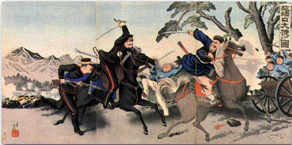
“A Great Victory at Port Arthur” by Adachi Ginkō, November 1894

A few prints detach cavalry combat from the congestion of battlefield tumult and place it alone at stage center, occasionally even giving the names of Chinese generals involved.