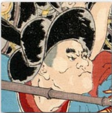
“The Japanese Second Army Battles at Jinzhou” by Shuko, November 1894 (with details of Chinese, left, and Japanese, right)

[res.23.294] Museum of Fine Arts, Boston