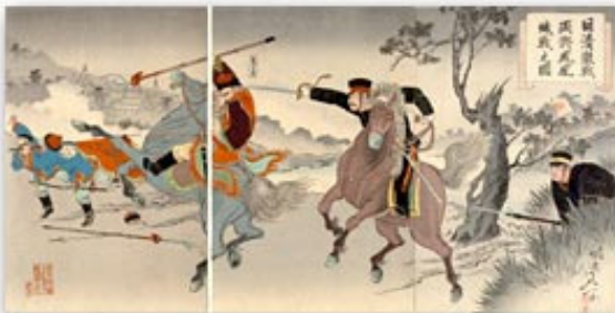
“Sino-Japanese Pitched Battles: Two Generals Fighting at Fenghuangcheng” by Watanabe Nobukazu, November 1894

[2000.009] Sharf Collection, Museum of Fine Arts, Boston