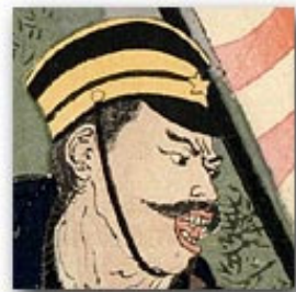
"Attacking Pyongyang, Our Troops Conquer the Enemy Fortress " by Mizuno Toshikata, September 1894 (above, with details of Chinese, left, and Japanese, right)

[res.23.344], Museum of Fine Arts, Boston