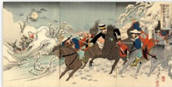
“Major Sakakibara Fights Fiercely to the South of Ximucheng” by Adachi Ginkō, January 1895

[2000.009] Sharf Collection, Museum of Fine Arts, Boston