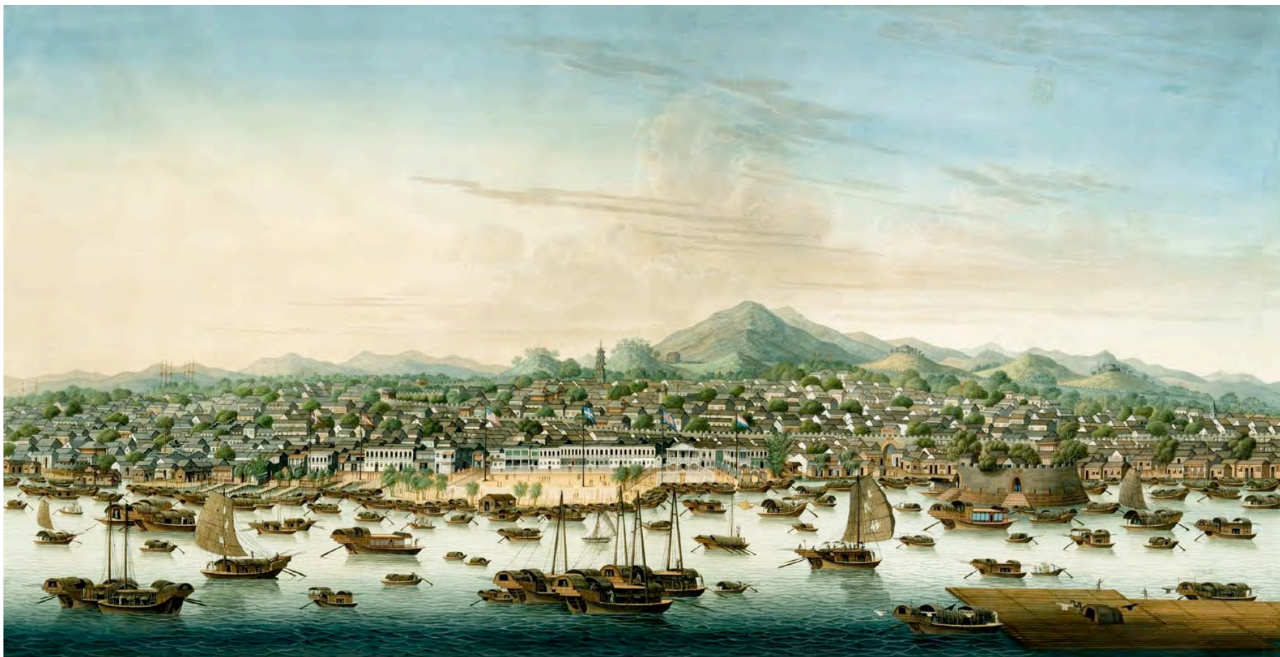
"Canton with the Foreign Factories," ca. 1800

Unknown Chinese artist. Peabody Essex Museum [cwC_1800c_E79708]