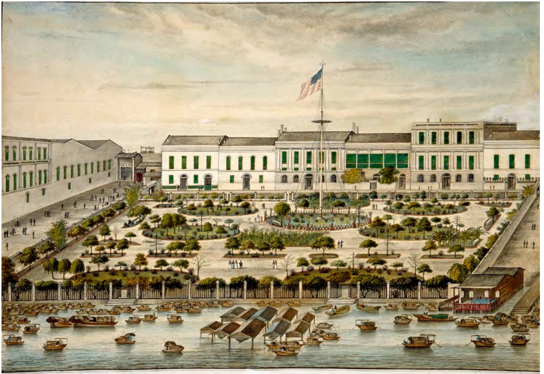
"The American Garden," 1844-45

Unknown Chinese artist. Peabody Essex Museum [cwC_1844-45_E82881_Garden]