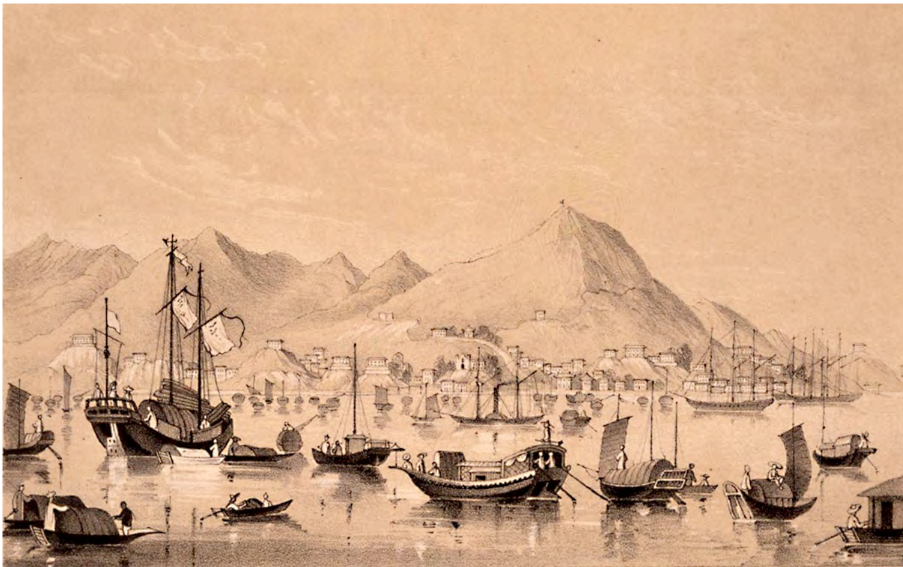
"View of Victoria Town, Island of Hong Kong, 1850," by B. Clayton. Hong Kong Museum of Art [cwhk_1850_AH64251]