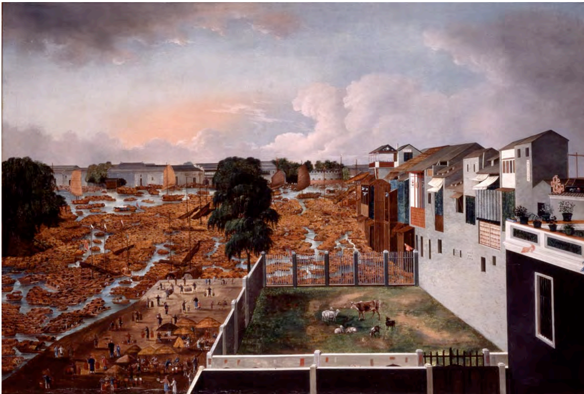
"A View of Canton from the Foreign Factories," ca. 1825 Unknown artist. Hong Kong Museum of Art [cwC_1825_AH928]