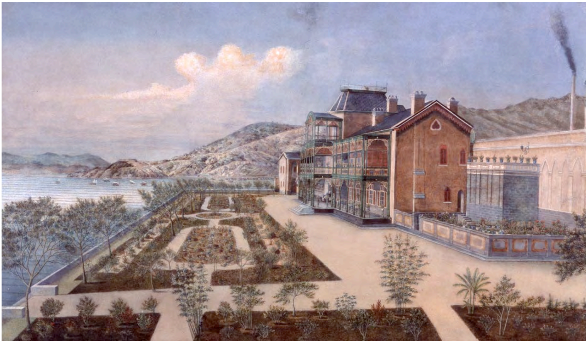
"The Mint and its Garden, Hong Kong," 1860's Unknown artist. Hong Kong Museum of Art [cwhk_1860s_AH8813]