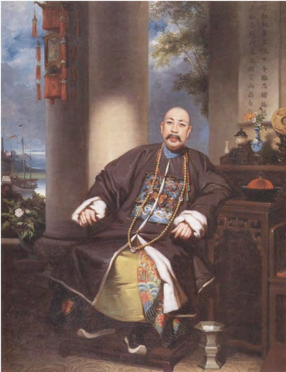
"The Hong Merchant Mouqua," ca. 1840s by Lam Qua. Peabody Essex Museum [cwPT_1840s_ct79_Mouqua]