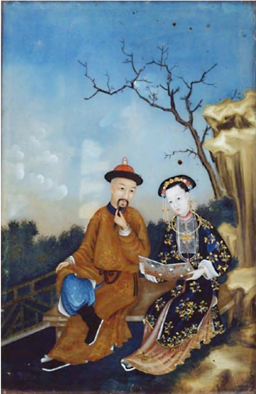
Reverse-glass painting, ca. 1760–80 Unknown Chinese Artist. Victoria & Albert, Guangzhou, China [cwPT_1760-80_2006AV3115_VA]