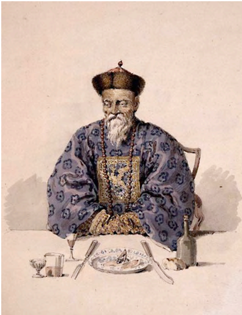
"Portrait of the Fou-yen of Canton at an English dinner," January 8, 1794 by William Alexander. British Museum [cwPT_1796_bm_AN166465001c]