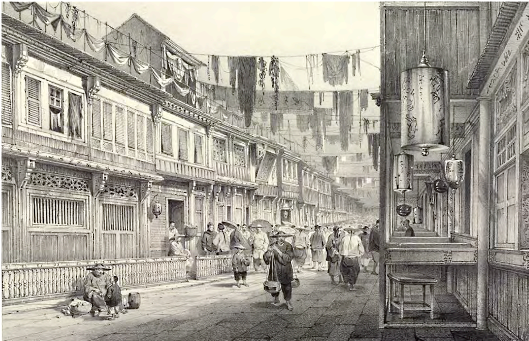
"New China Street in Canton," 1836-1837