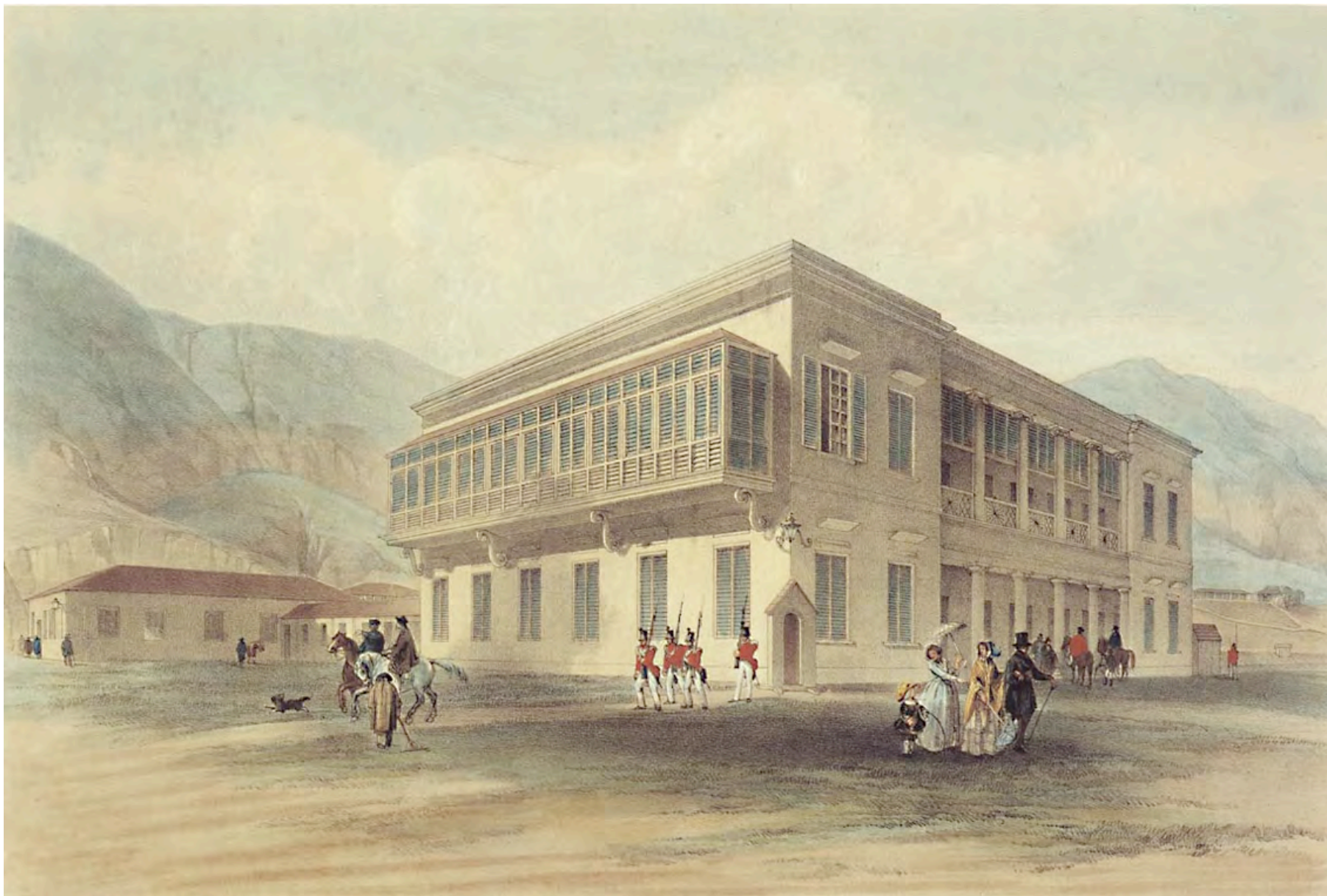
"Flagstaff House, Hong Kong," 1846

Drawn by Murdoch Bruce, lithograph by A. Maclure. Hong Kong Museum of Art [cwhk_1846_AH643898]