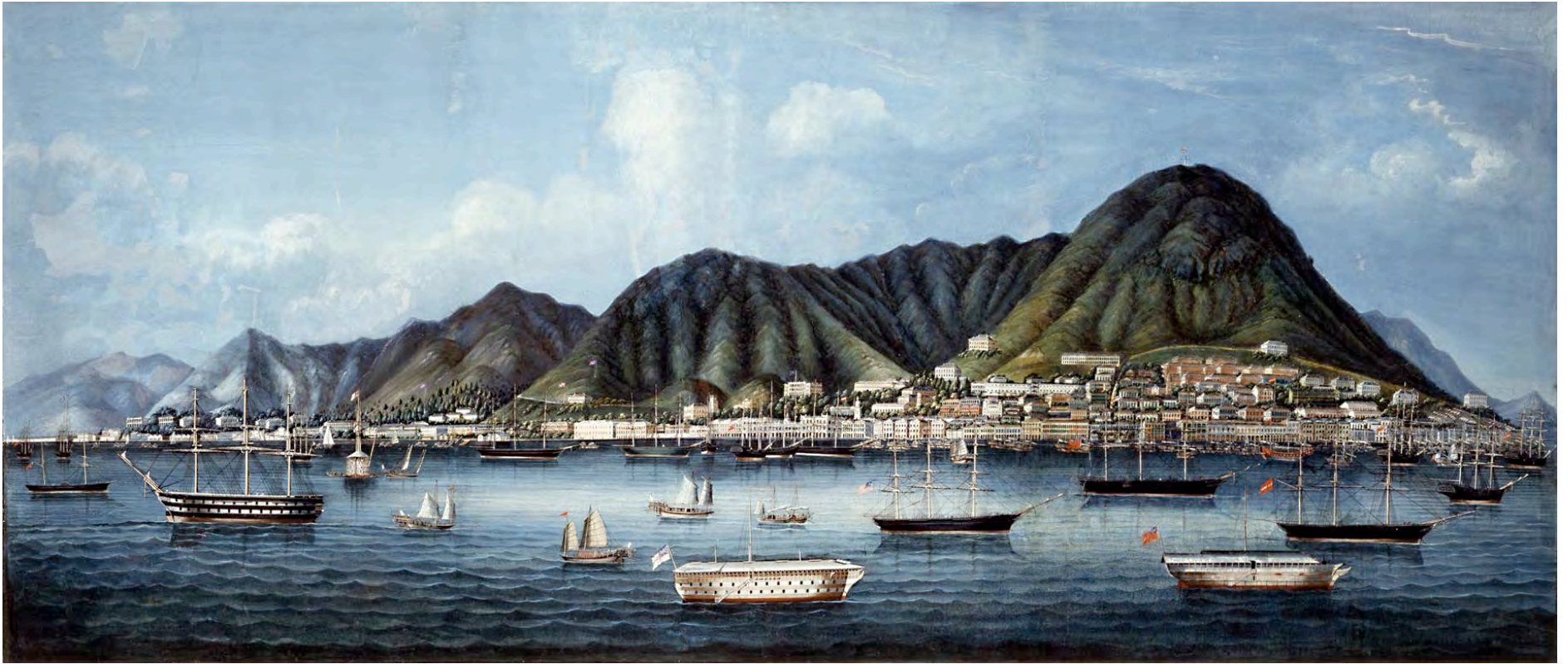
"City of Victoria, Hong Kong,, 1860–1865

Unknown Chinese artist. Peabody Essex Museum [cwhk_1860-65_E81235]