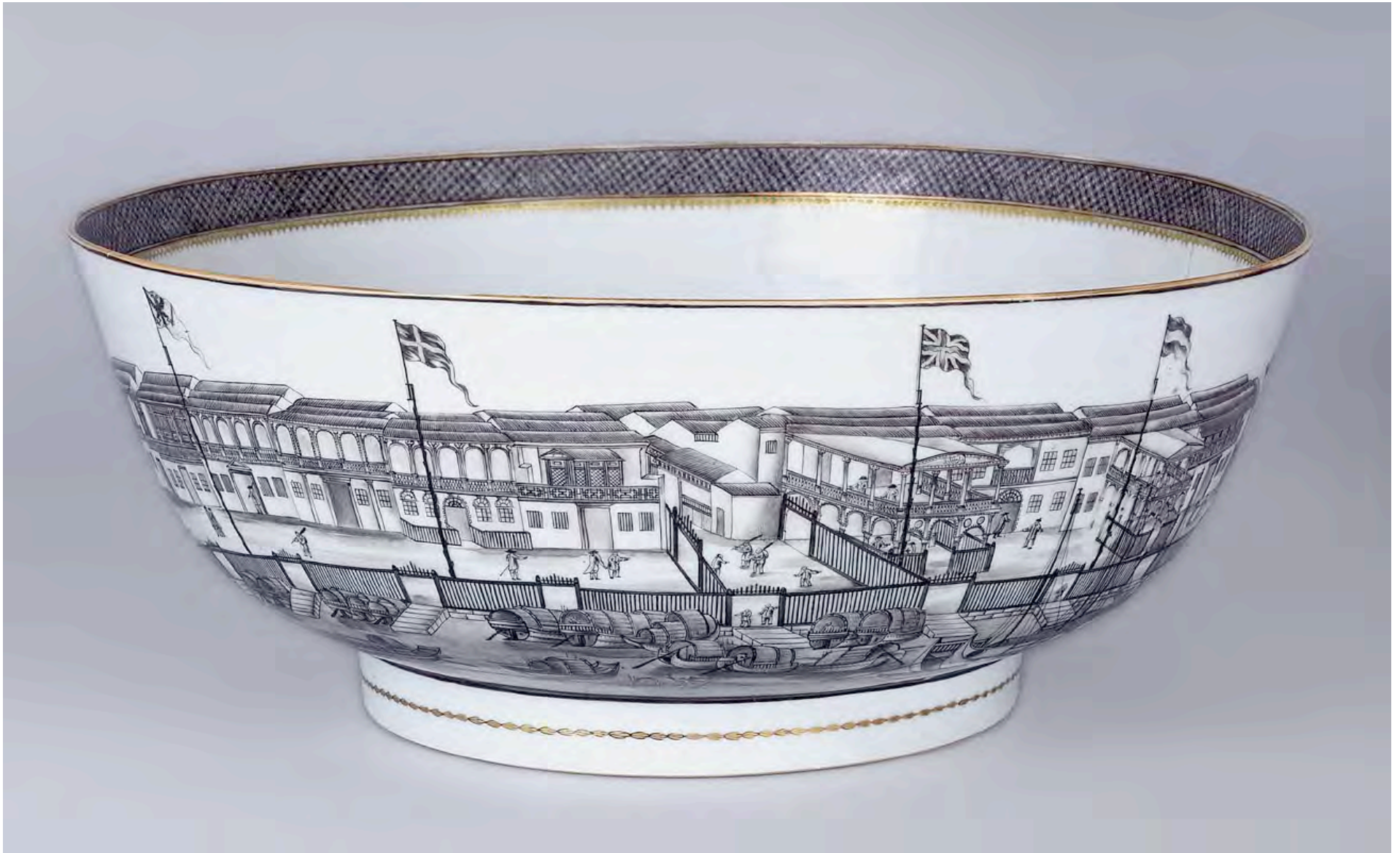
Porcelain punch bowl, ca. 1785 Peabody Essex Museum [cwO_1785c_E75076]