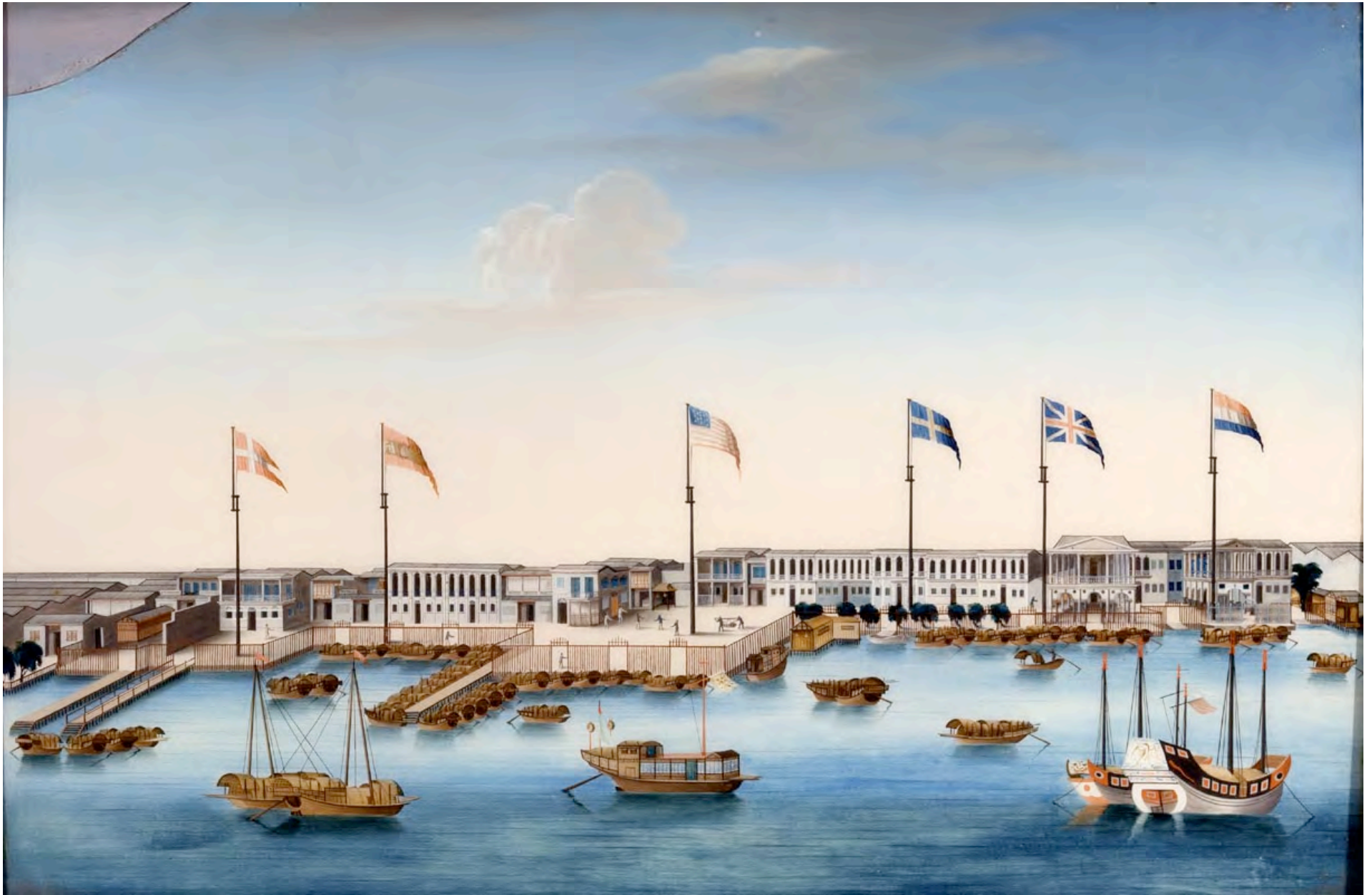
"Foreign Factory Site at Canton," ca. 1805

Reverse-glass painting, unknown Chinese artist. Peabody Essex Museum [cwC_1805_E78680]