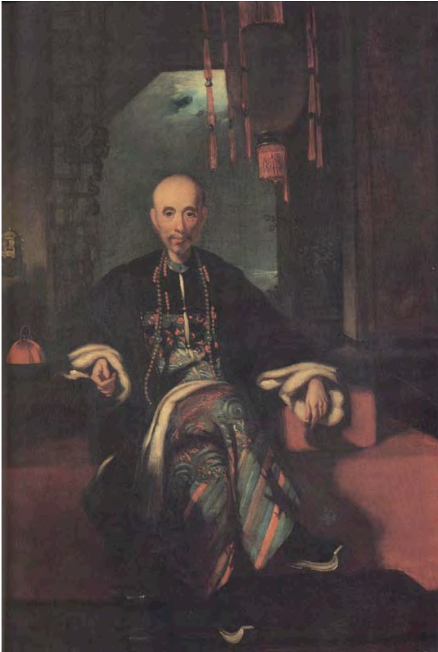
"Howqua" by George Chinnery, 1830