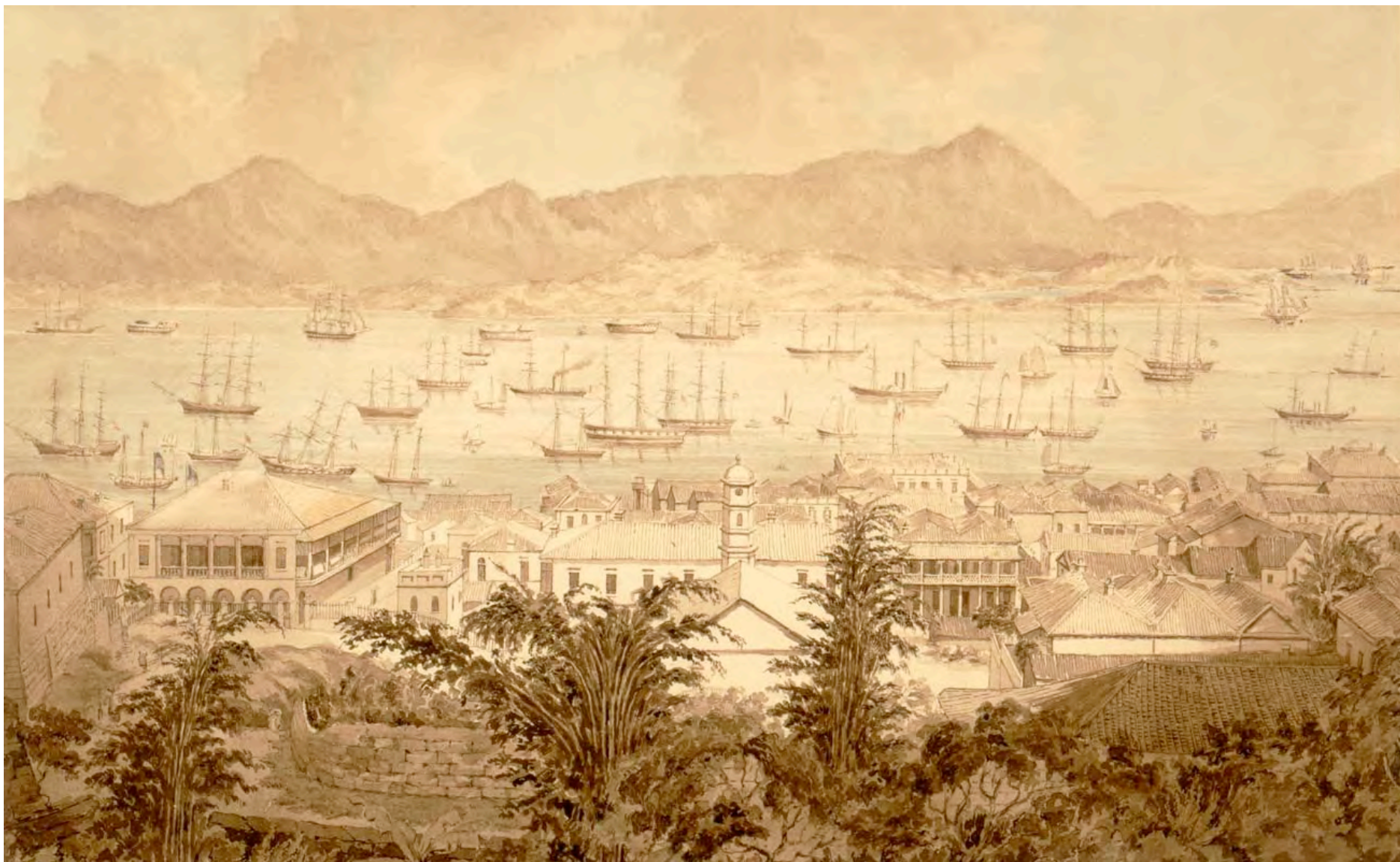
"View of Hong Kong Harbor," 1860–1870

by Marciano Antonio Baptista. Peabody Essex Museum [cwHK_1860-70_M10874]