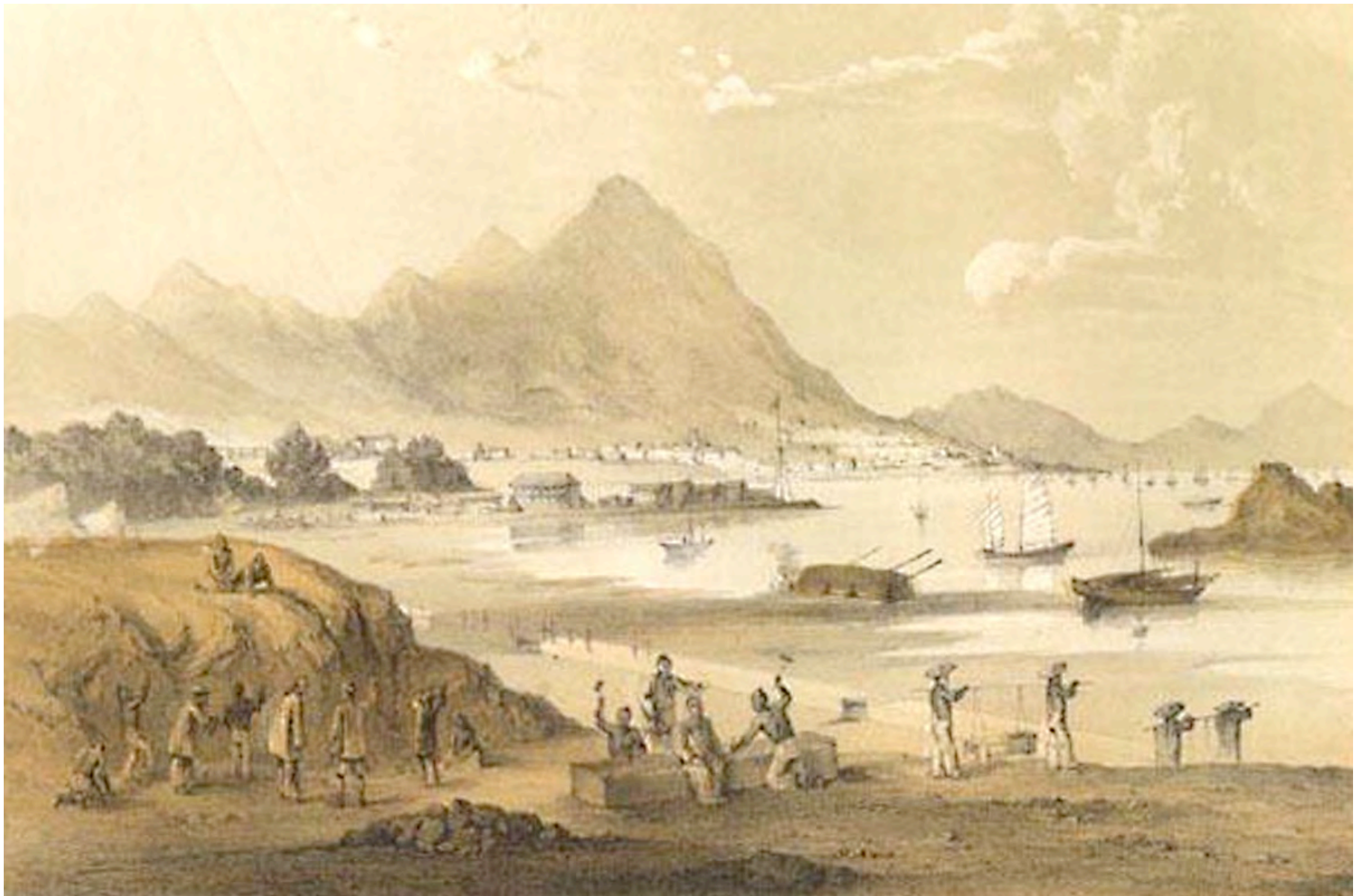
"View of Hong Kong From East Market, April 7, 1853,"

by William Heine. Commodore Matthew Perry's Japan Expedition [cwhK_1853_Heine_bx]