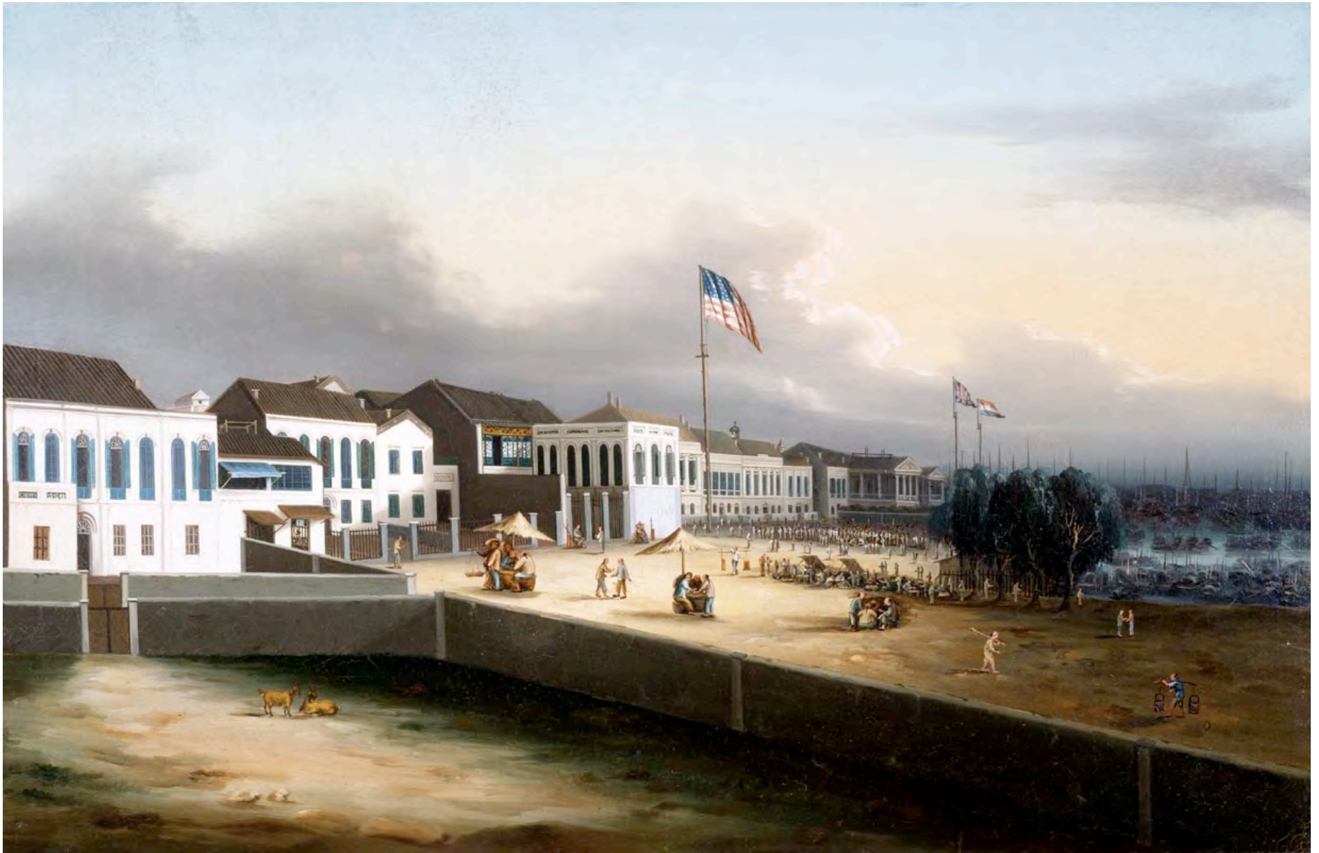
"The Factories of Canton" 1825-1835

Attributed to Lam Qua, oil on canvas. Peabody Essex Museum [cwC_1825-35_M3793]