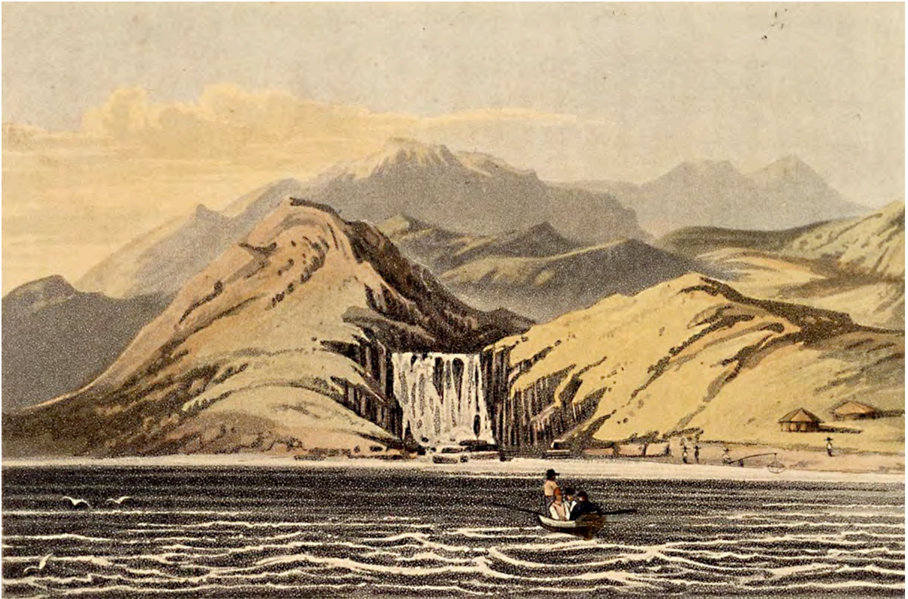
"Waterfall at Aberdeen," 1817

by William Harvell. Hong Kong Museum of Art [cwhk_1817_AH64362]