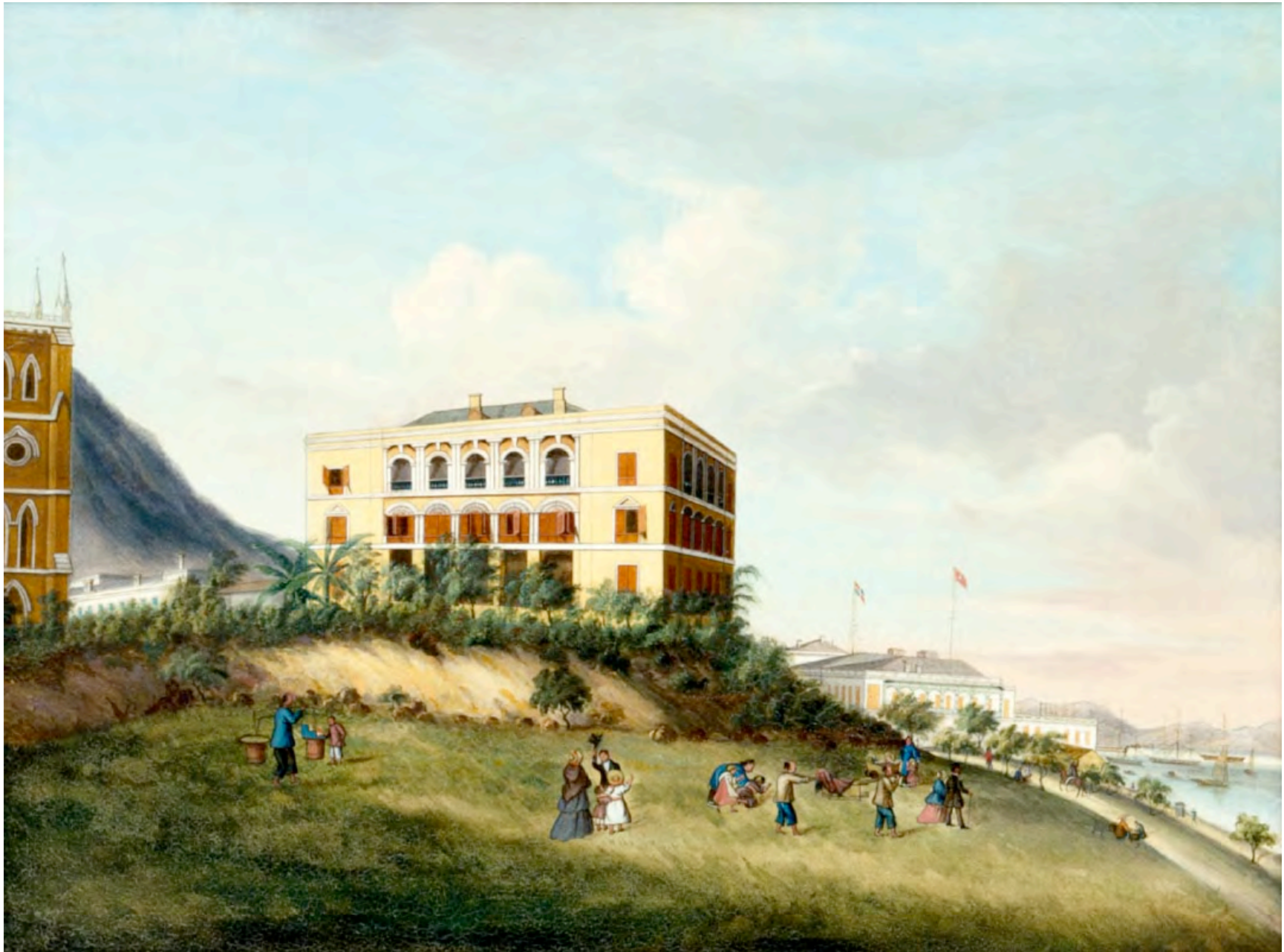
"Residence of Augustine Heard and Company, Hong Kong," ca. 1860

Unknown artist. Peabody Essex Museum [cwHK_1860c_M17297]