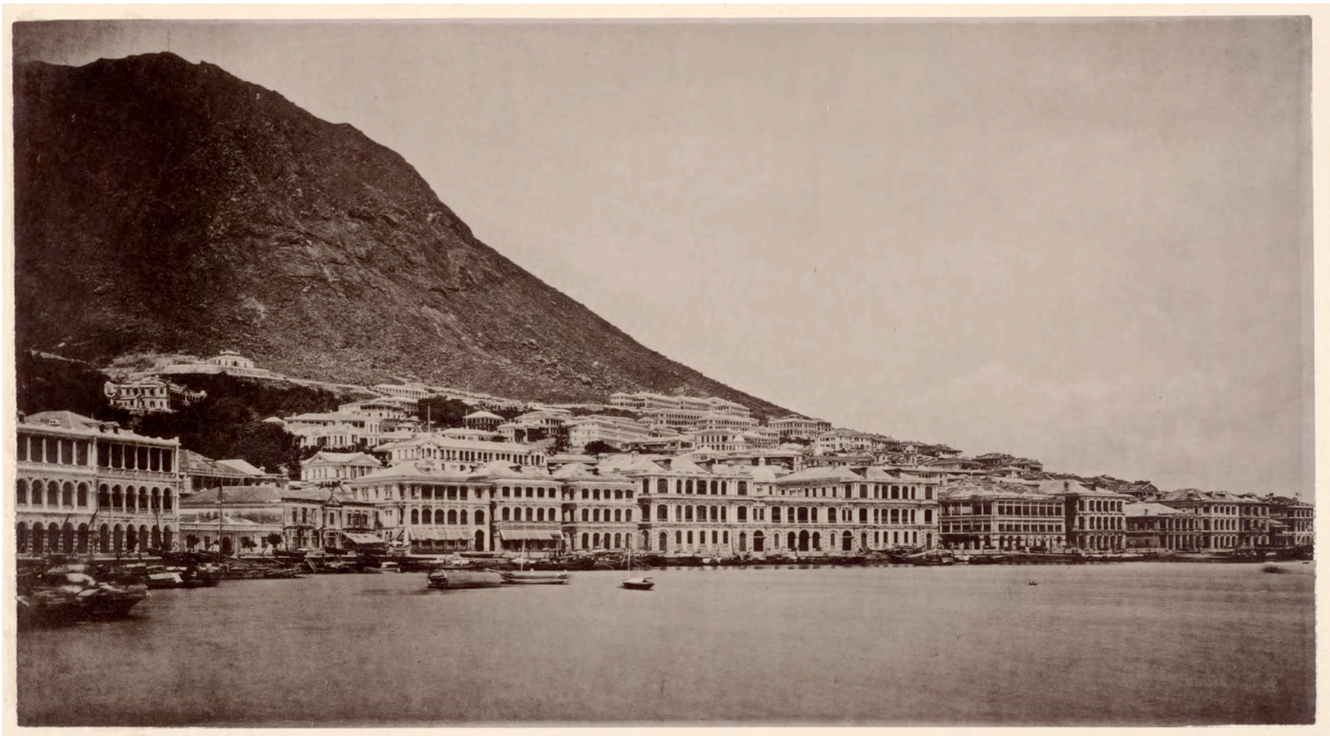
“The Praya, Hong-Kong” by John Thomson Illustrations of China and Its People, volume 1 (1873)