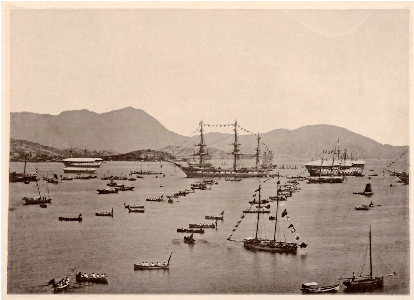
"Hong-Kong Harbour" by John Thomson Illustrations of China and Its People, volume 1 (1873)