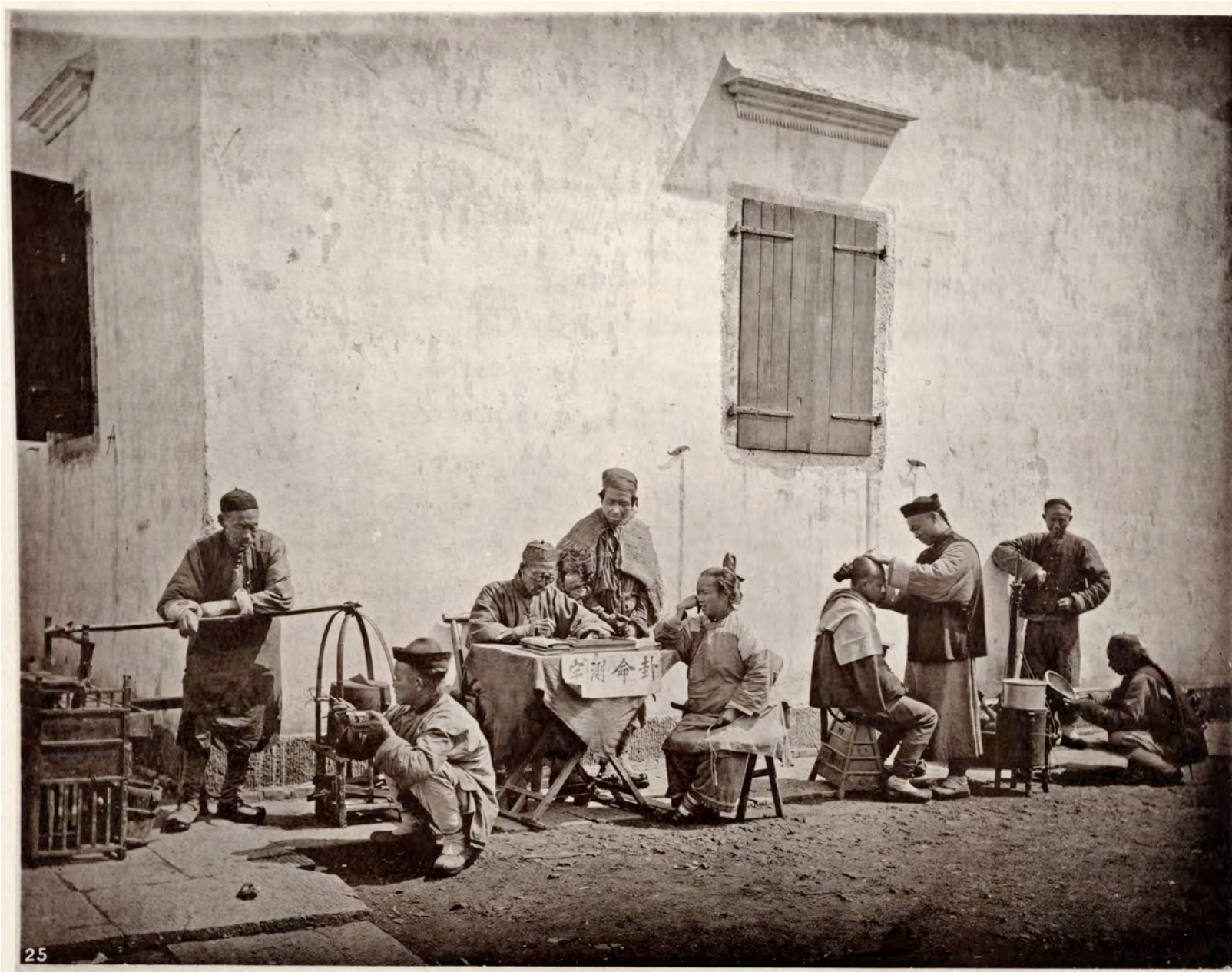
25 “Street Groups, Kiu-Kiang” by John Thomson Illustrations of China and Its People, volume 3 (1874)