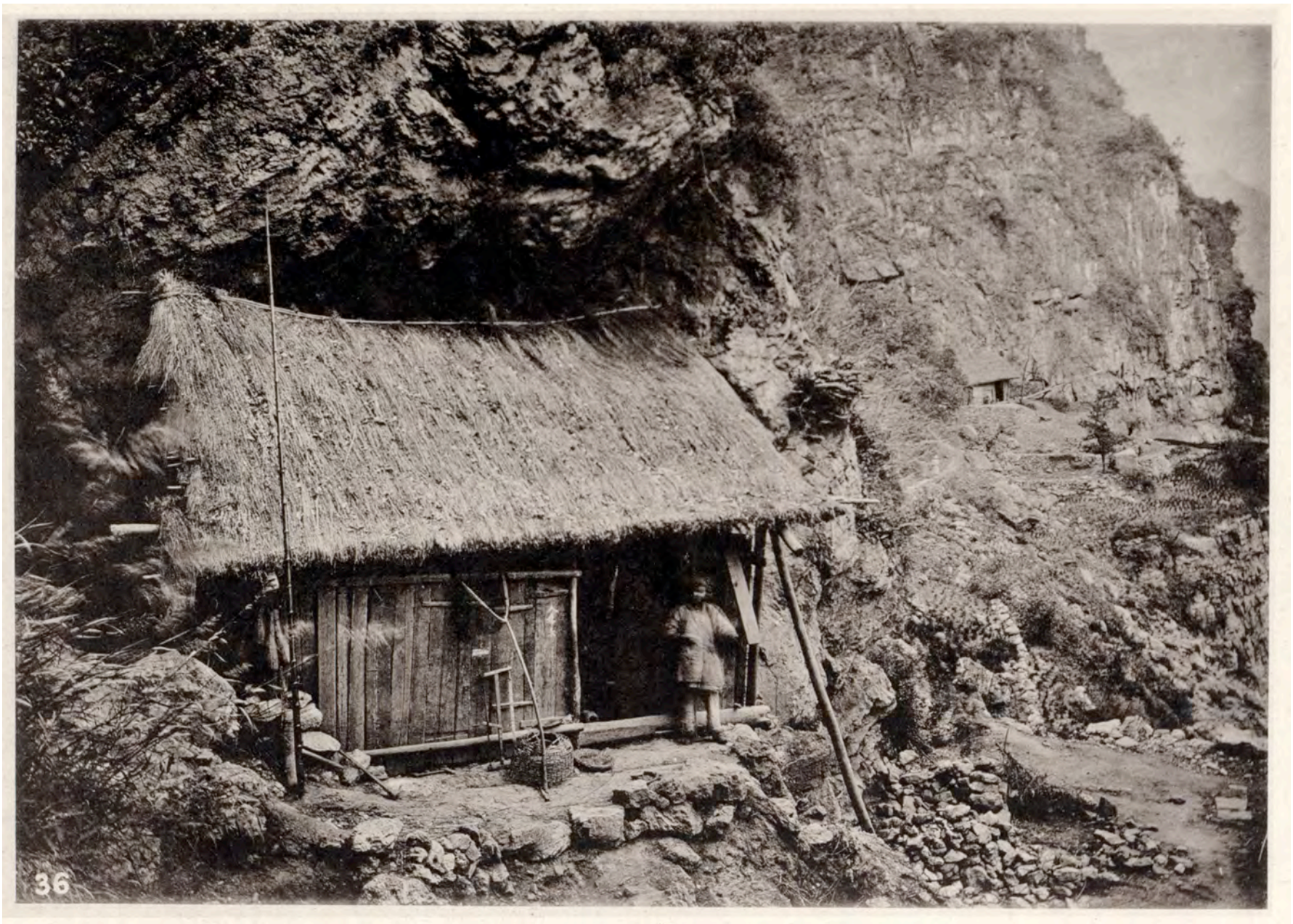
“Cave Dwellings, I-Chang Gorge, River Yangtze” by John Thomson Illustrations of China and Its People, volume 3 (1874)