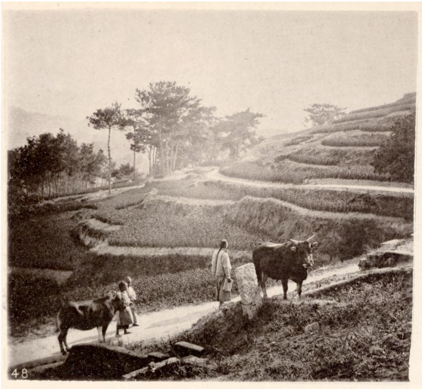
“Terracing Hills” by John Thomson Illustrations of China and Its People, volume 2 (1873)