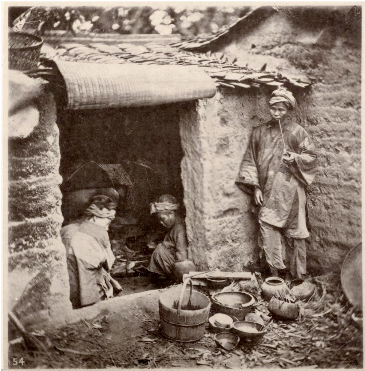
“Beggars Living in a Tomb” by John Thomson Illustrations of China and Its People, volume 2 (1873)