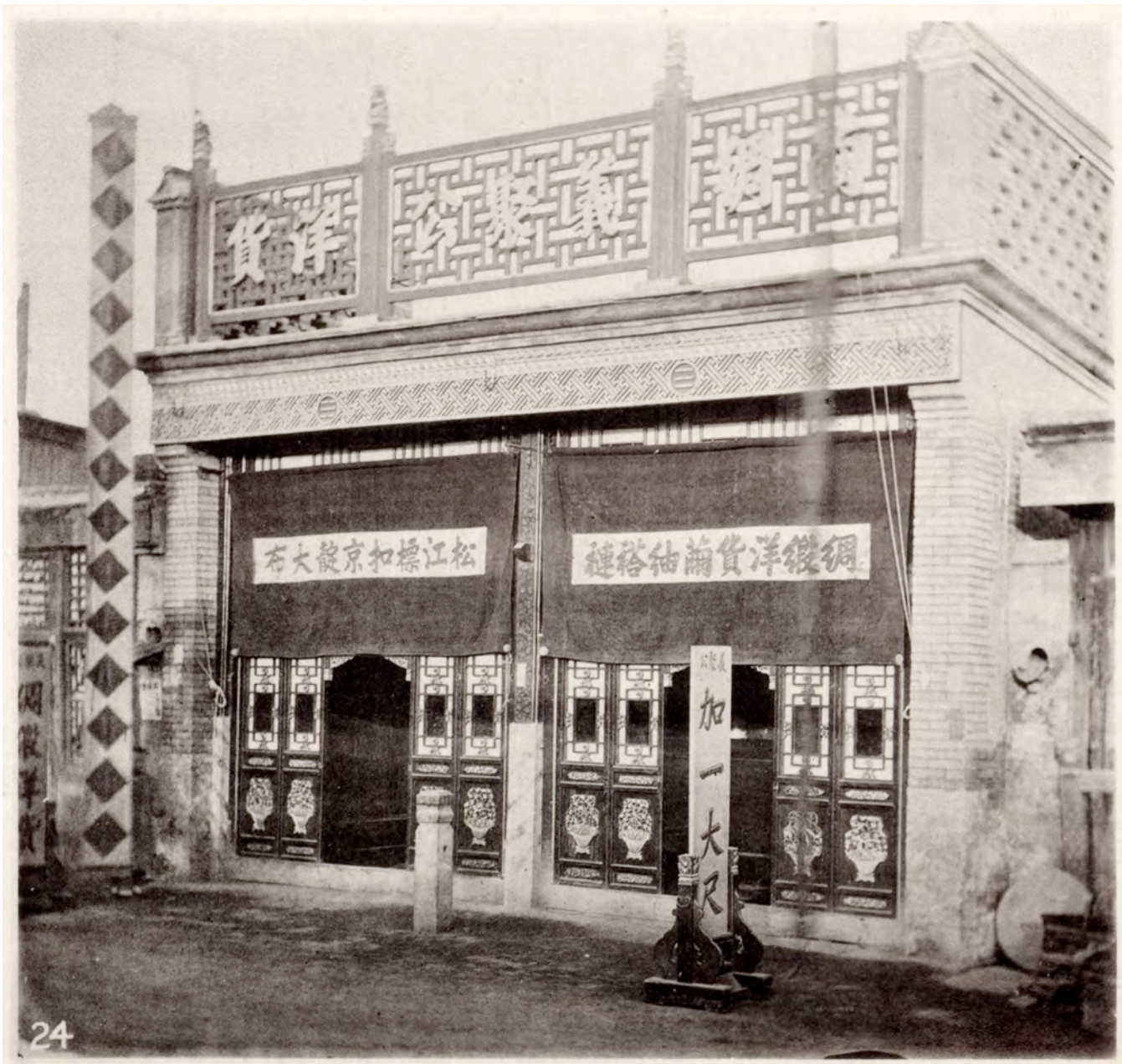
"A Pekingese Shop" by John Thomson Illustrations of China and Its People, volume 4 (1874)