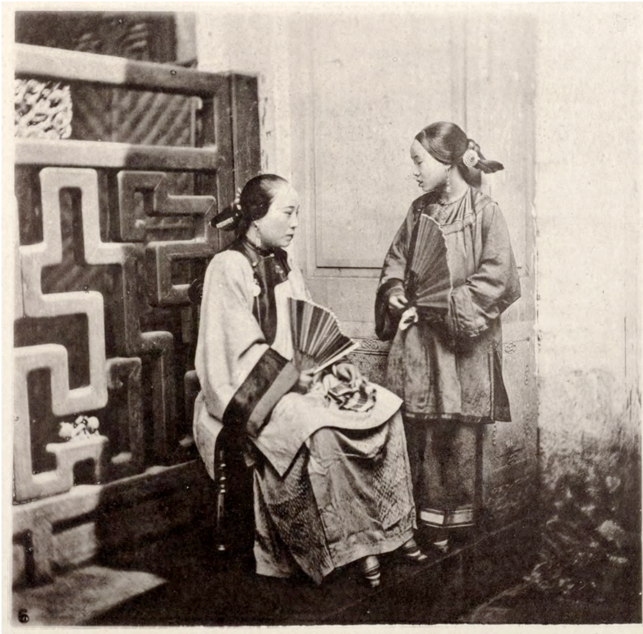
“Snowy Valley, Women of Ningpo” by John Thomson Illustrations of China and Its People, volume 3 (1874)