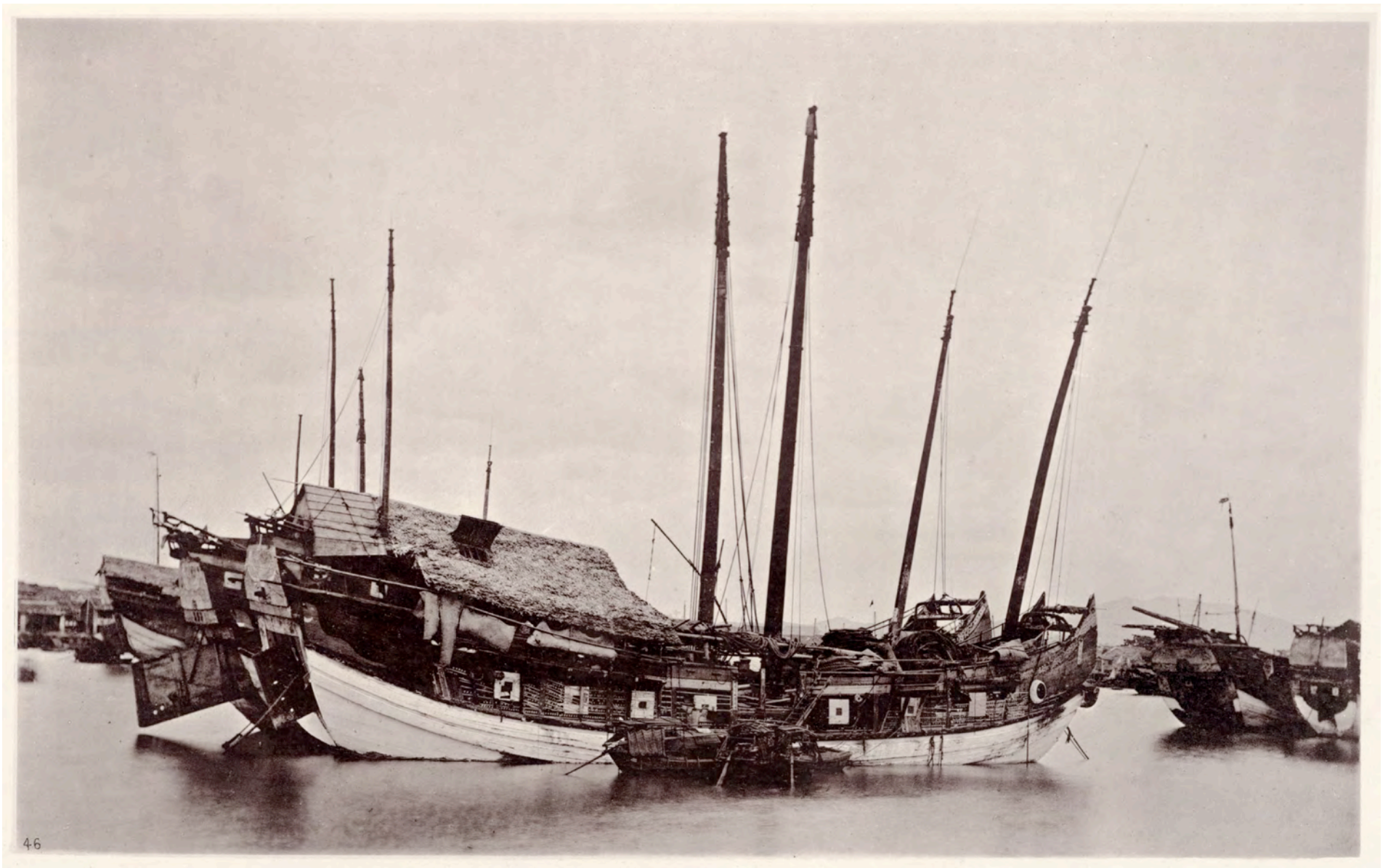
"Old Junks" by John Thomson Illustrations of China and Its People, volume 2 (1873)