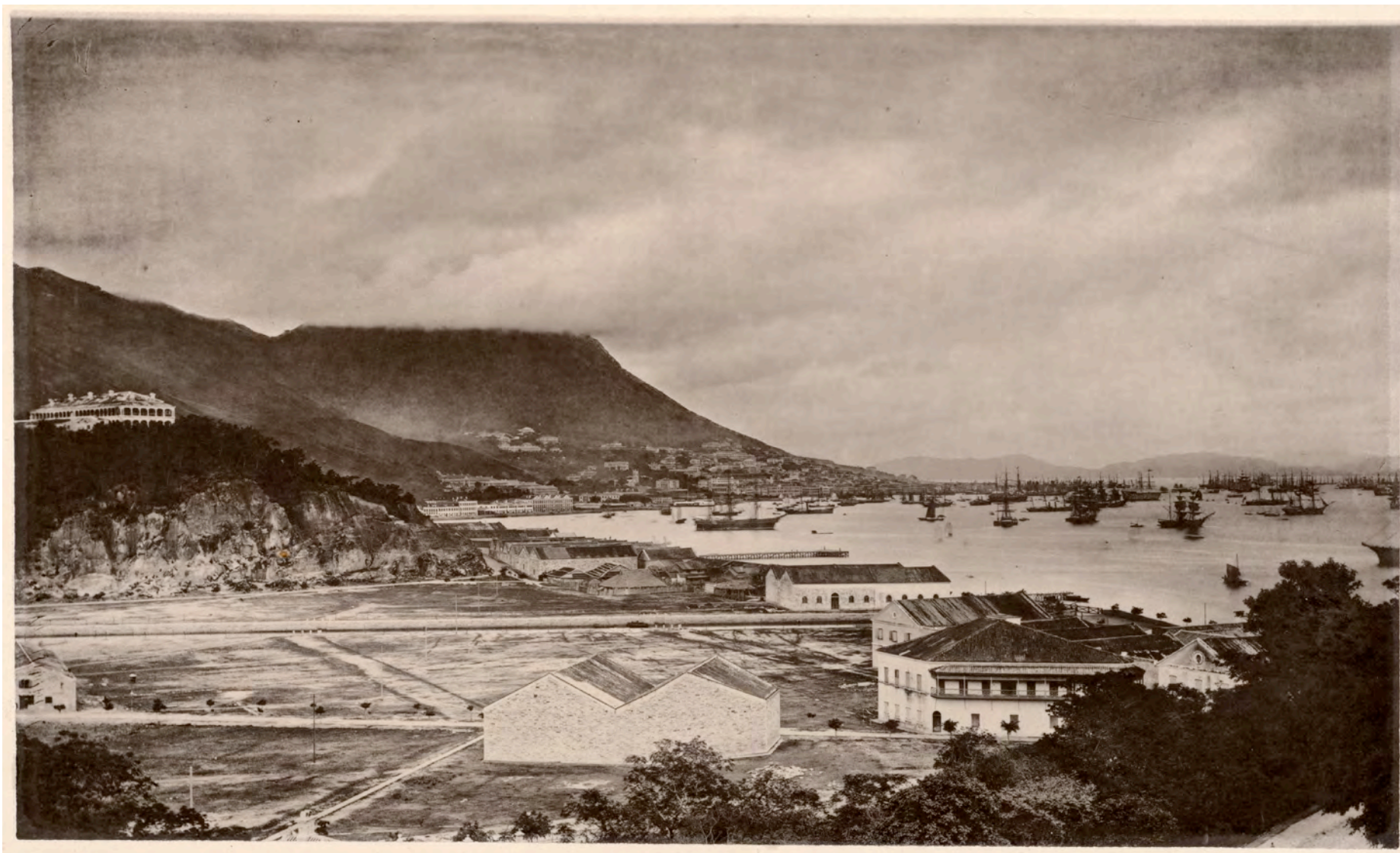
"Hong-Kong" by John Thomson Illustrations of China and Its People, volume 1 (1873)