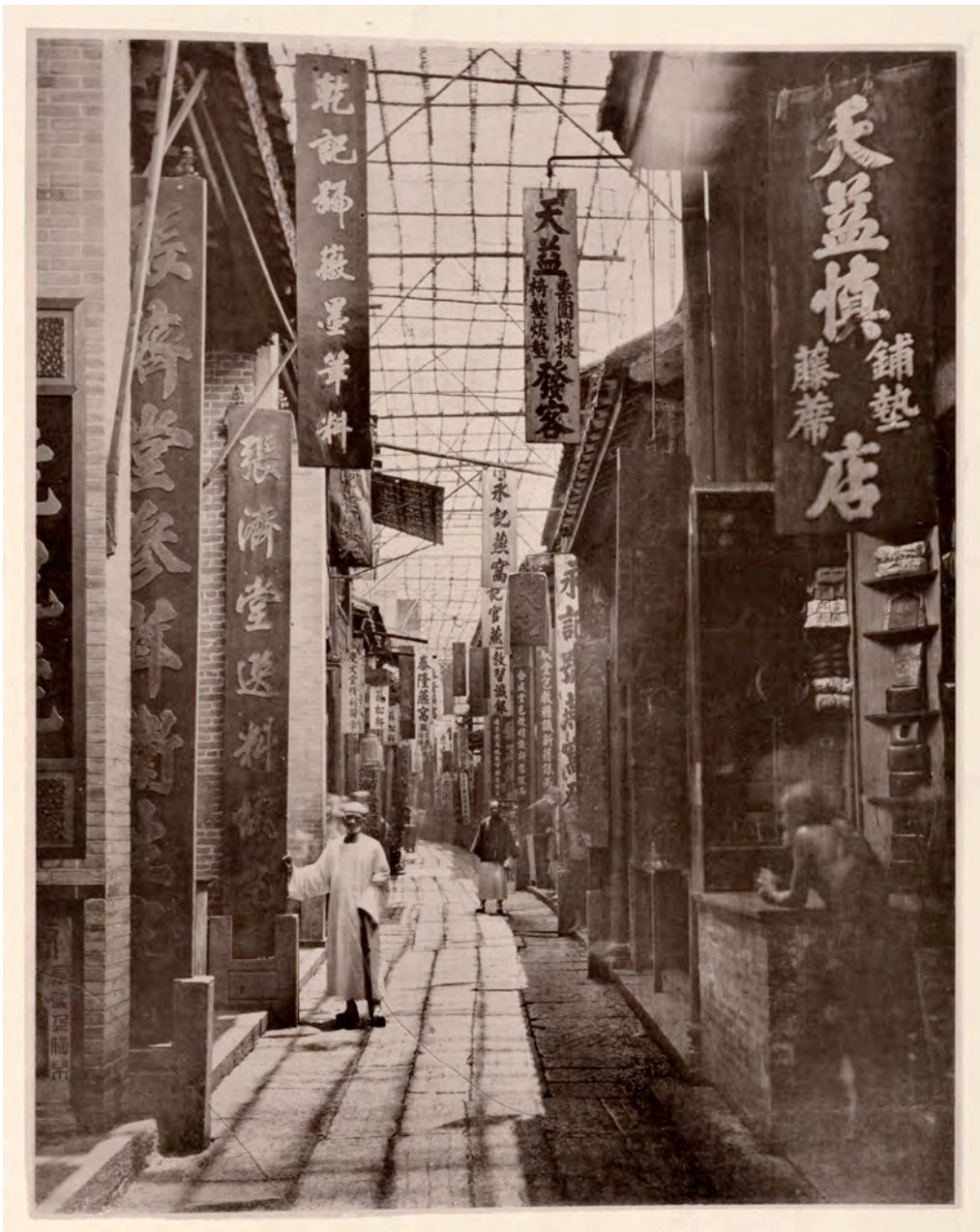
"Physic Street, Canton" by John Thomson Illustrations of China and Its People, volume 1 (1873)