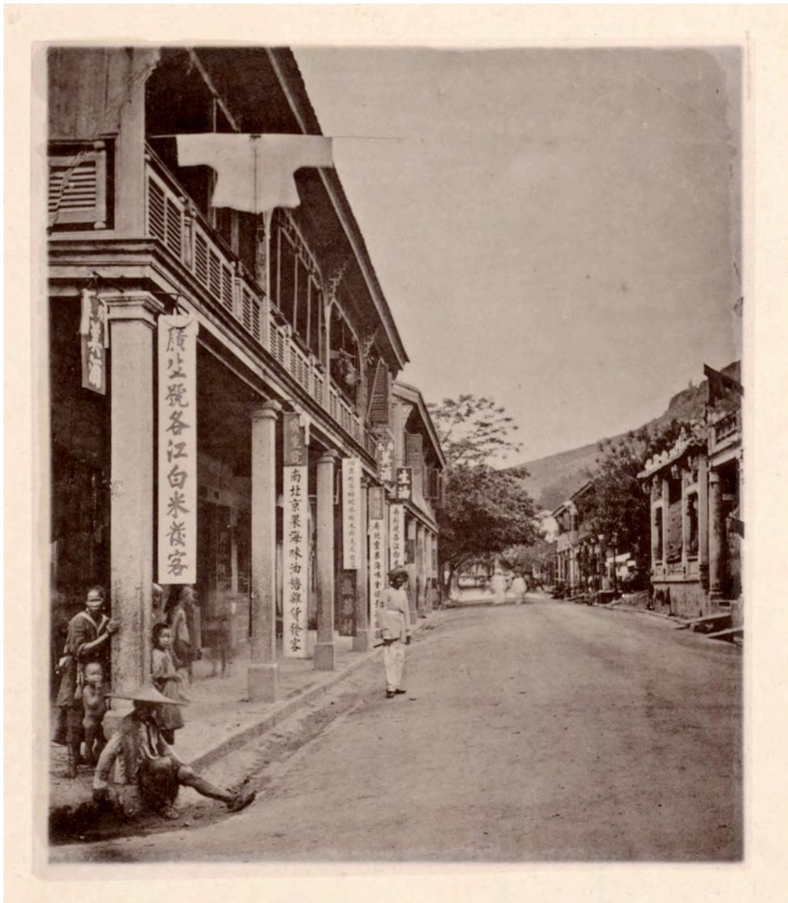
"A Street in Hong-Kong" by John Thomson Illustrations of China and Its People, volume 1 (1873)