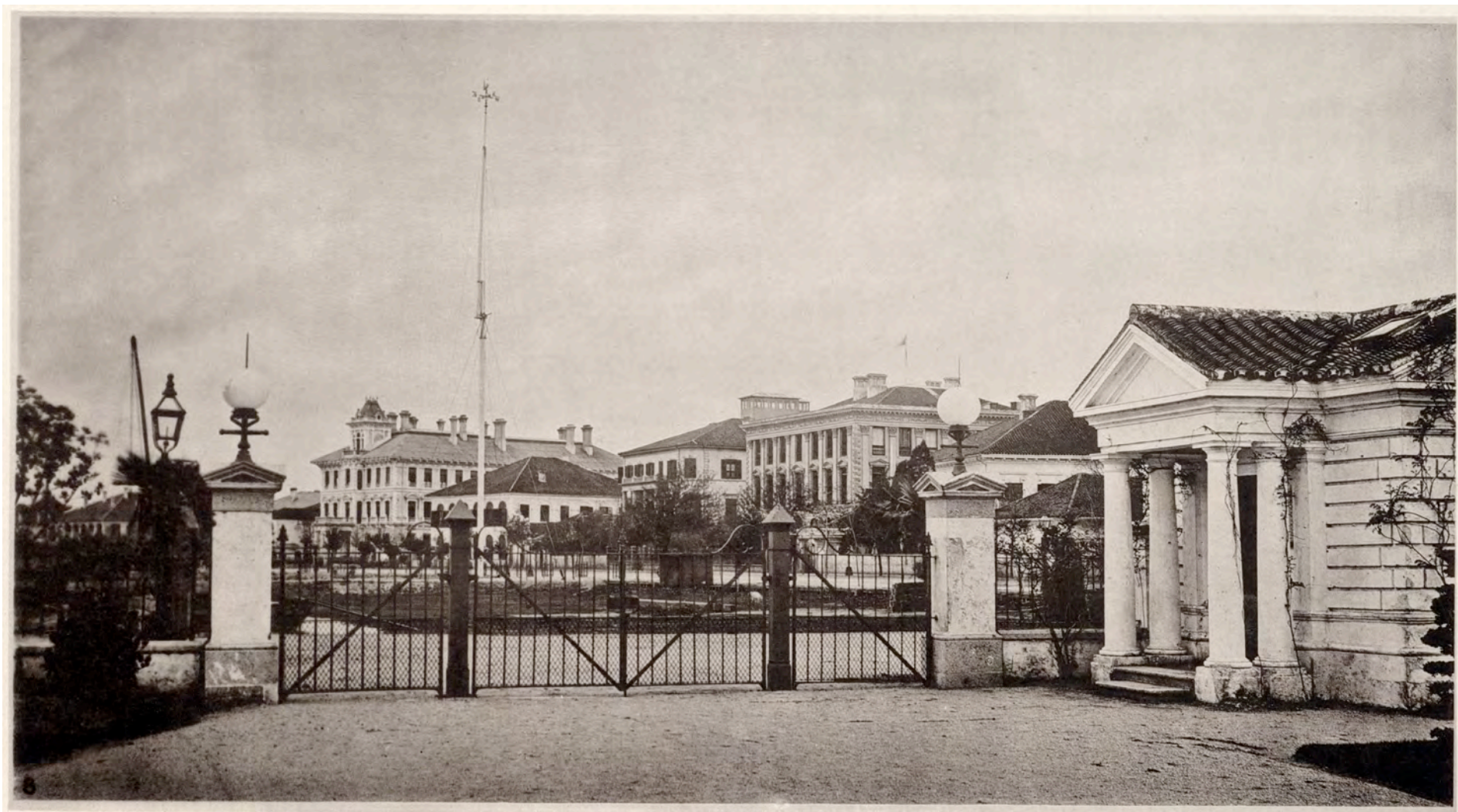
"Part of Shanghai Bund in 1872" by John Thomson Illustrations of China and Its People, volume 3 (1874)