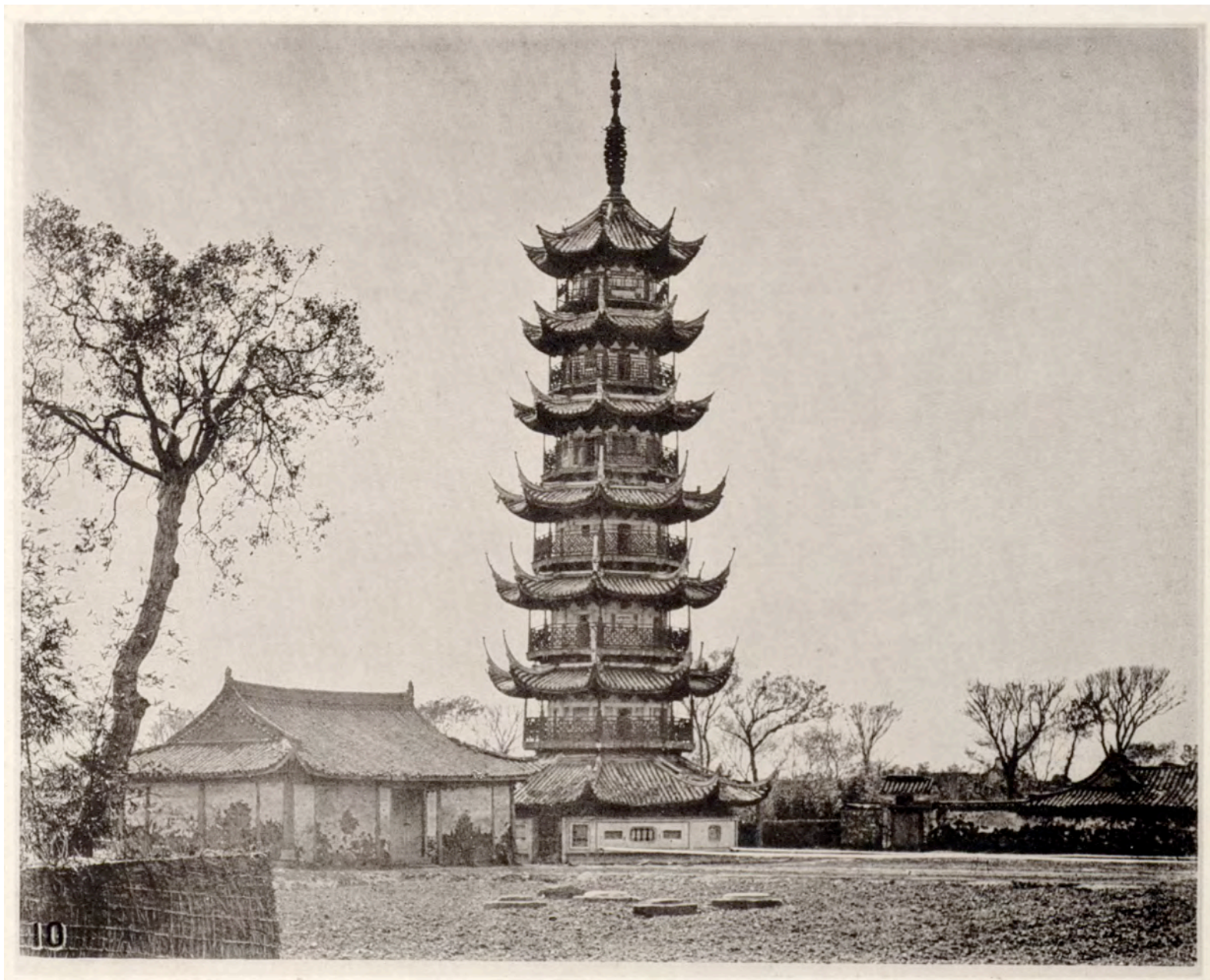
“The Lung-hwa-ta or Pagoda of the Dragon's Glory” by John Thomson Illustrations of China and Its People, volume 3 (1874)