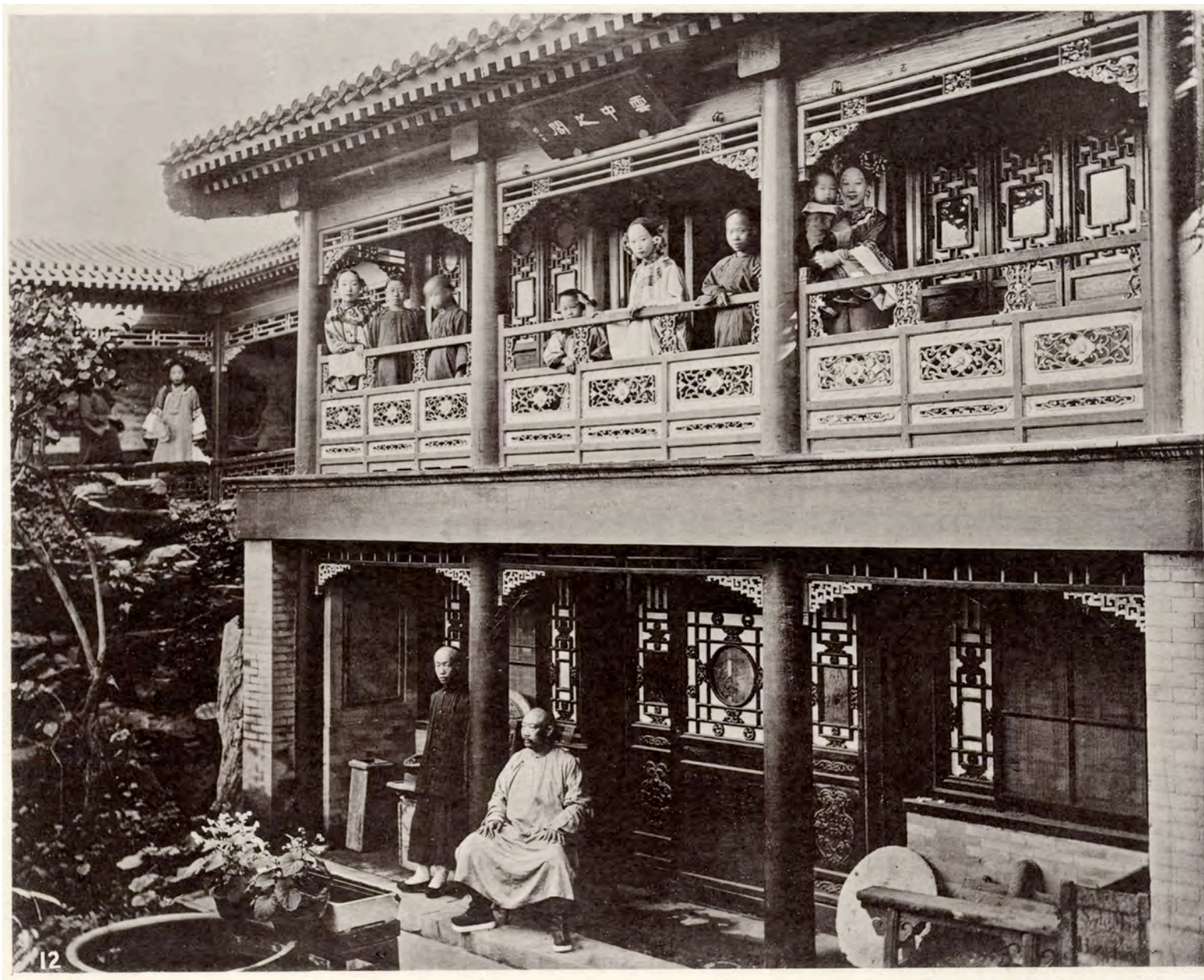
"A Mandarin's House, Peking" Illustrations of China and Its People, volume 4 (1874)