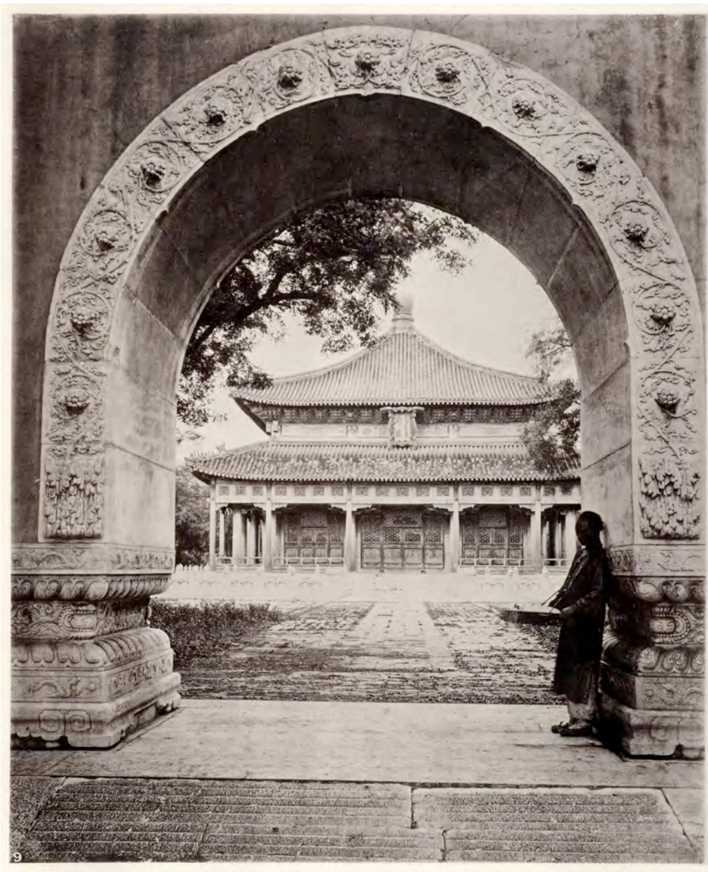
“The Kwo-Tsze-Keen, or National University, Peking” by John Thomson Illustrations of China and Its People, volume 4 (1874)