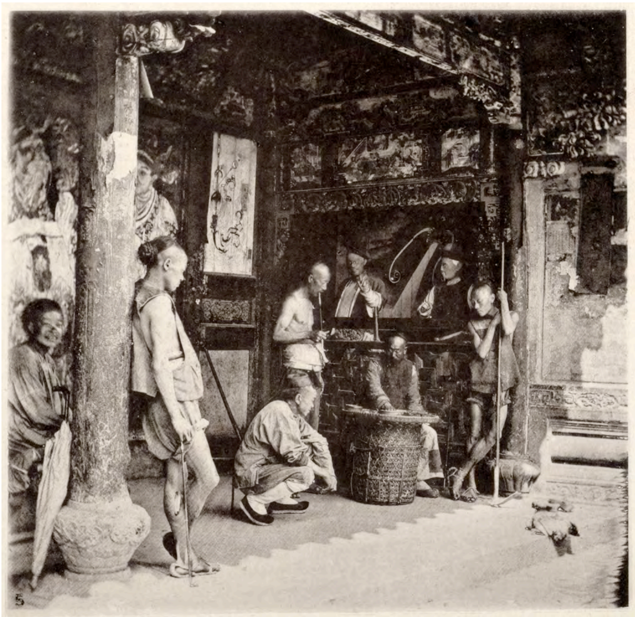
"Snowy Valley, Wayside Temple" by John Thomson Illustrations of China and Its People, volume 3 (1874)