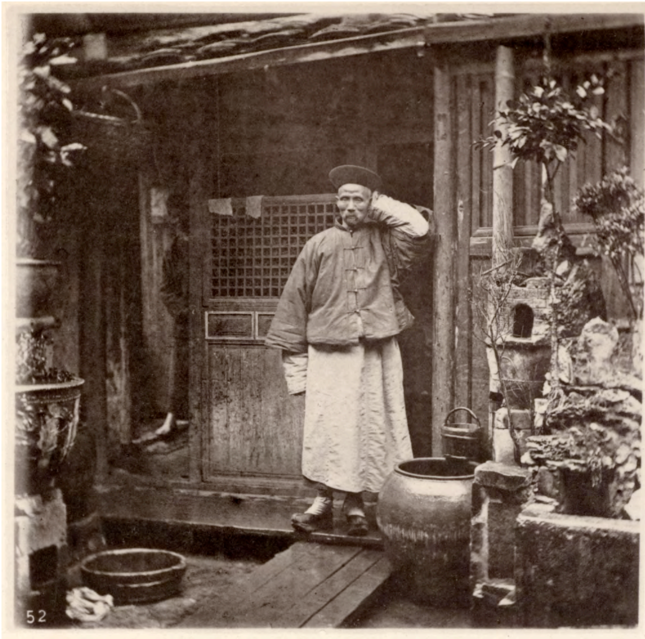
“The Ma-Qui” by John Thomson Illustrations of China and Its People, volume 2 (1873)