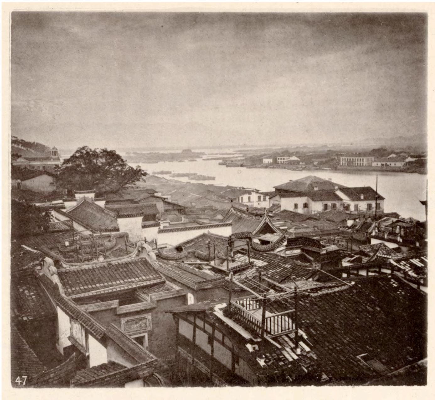
"Part of the Foreign Settlement, Foochow" by John Thomson Illustrations of China and Its People, volume 2 (1873)