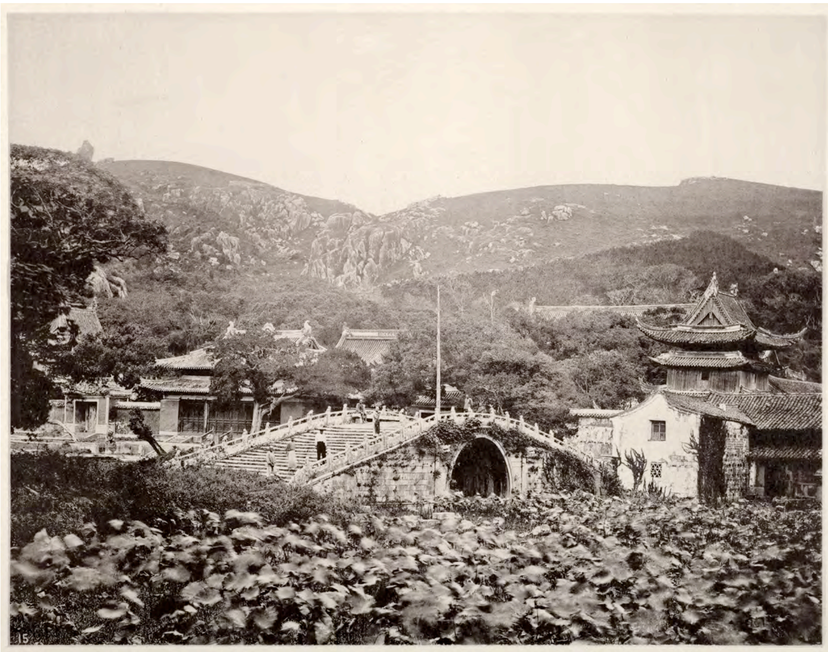
“Kwanyin Temple, Puto Island” by John Thomson Illustrations of China and Its People, volume 3 (1874)