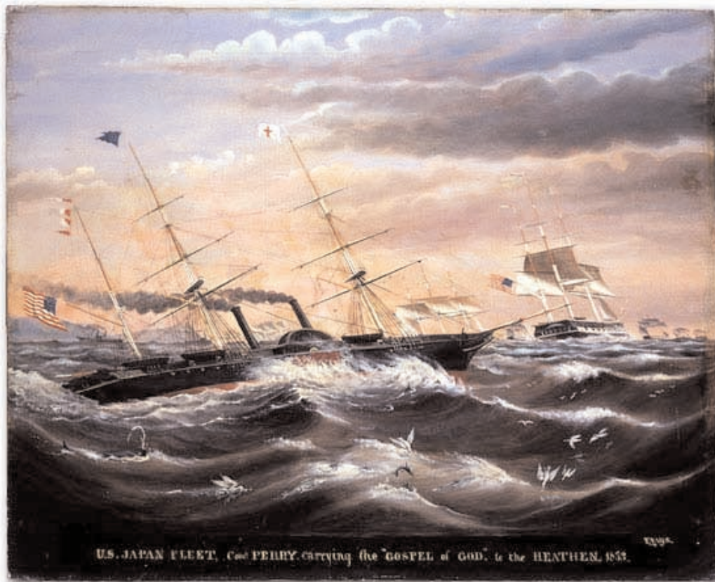
"U.S. JAPAN FLEET. Com. PERRY carrying the 'GOSPEL of GOD' to the HEATHEN, 1853" by James G. Evans, oil on canvas

At the same time, it was widely understood that he was also returning Christianity to a heathen society that had driven out such teachings over two centuries previously. Accordingly, in this graphic rendering, we behold both steamship and sailship plowing through frothy seas above a large caption reading "U.S. JAPAN FLEET. Com. PERRY carrying the 'GOSPEL of GOD' to the HEATHEN, 1853."