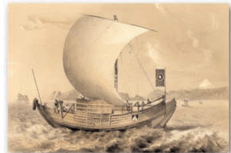
Japanese "junk" as recorded by the Perry mission in the official Narrative

Japan's adoption of the "closed country" policy in the early-17th century involved not merely keeping foreigners out, but also keeping Japanese in. Thus, severe restrictions were placed on shipbuilding, and maritime activity was restricted to sailing small vessels in coastal waters. An illustration in the official narrative of the Perry mission depicted one of the single-sail "junks" that patrolled the waters outside Edo.