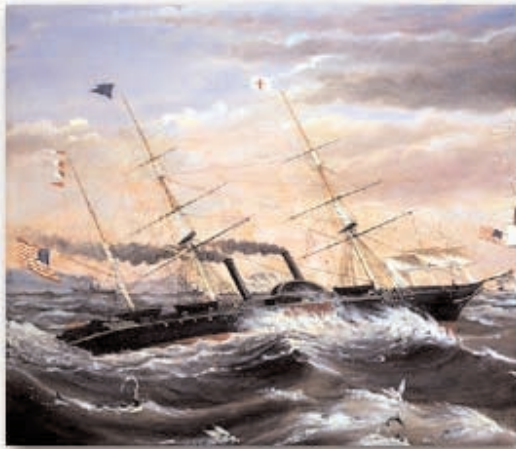
"Carrying the 'Gospel of God' to the Heathen"