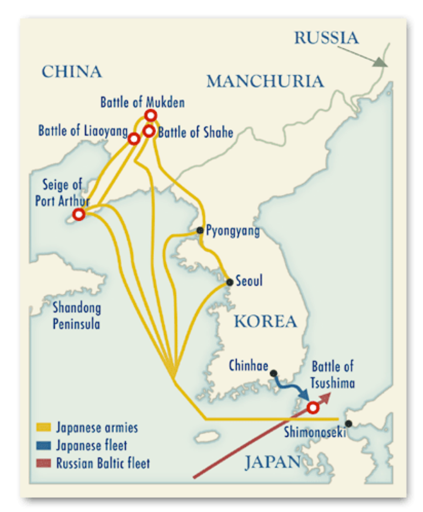
The Russo-Japanese War began in February 1904 and ended in September 1905.

The battles, moreover, were titanic and state-of-the-art. A Japanese armada of battleships, destroyers, cruisers, and torpedo boats initiated the war with a surprise attack on February 8 that drove Russia's Far Eastern Fleet into the harbor at Port Arthur and blockaded it there.