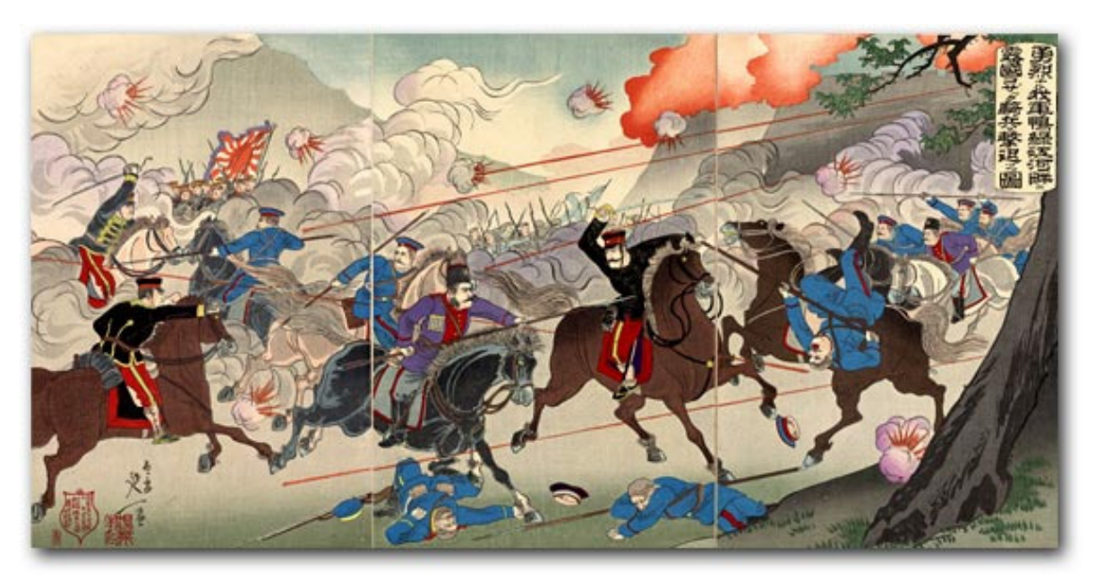
"Picture of Our Valorous Military Repulsing the Russian Cossack Cavalry on the Bank of the Yalu River" by Watanabe Nobukazu, March 1904

[2000.544] Sharf Collection, Museum of Fine Arts, Boston