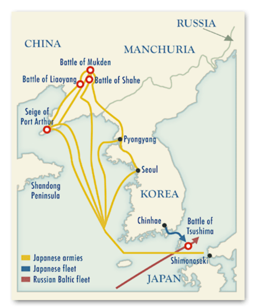
The Russo-Japanese War began in February 1904 and ended in September 1905.

The battles, moreover, were titanic and state-of-the-art. A Japanese armada of battleships, destroyers, cruisers, and torpedo boats initiated the war with a surprise attack on February 8 that drove Russia's Far Eastern Fleet into the harbor at Port Arthur and blockaded it there.