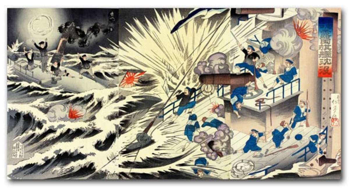
"Harbor Entrance of Port Arthur: Russian Flagship Sinking at Port Arthur" by Nitei, 1904

[2000.063] Sharf Collection, Museum of Fine Arts, Boston