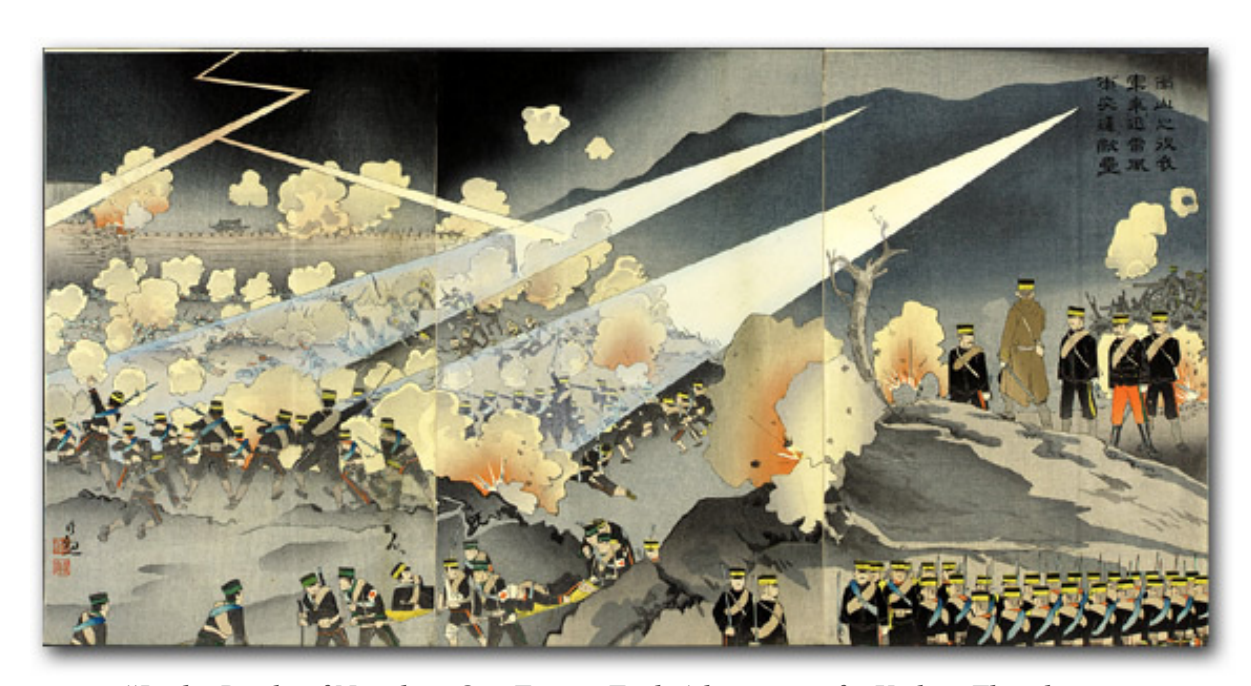
"In the Battle of Nanshan Our Troops Took Advantage of a Violent Thunderstorm and Charged the Enemy Fortress" by Kobayashi Kiyochika, 1904

One of the most dramatic renderings of the war on land came, unsurprisingly, from Kiyochika. Ornately titled "In the Battle of Nanshan Our Troops Took Advantage of a Violent Thunderstorm and Charged the Enemy," this panoramic scene bristles with searchlights, explosions, and streaks of lightning—conveying a sense of both the vastness of the Manchurian landscape and the titanic nature of the struggle against Russia.