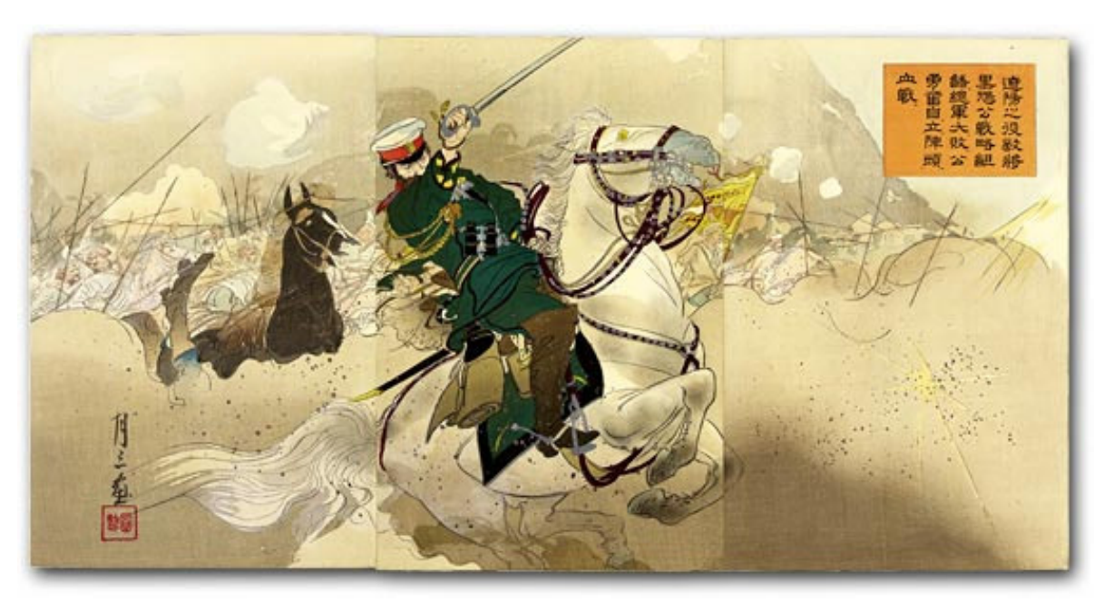
"The Battle of Liaoyang: The Enemy General Prince Kuropatkin, Having Tactical Difficulties and the Whole Army Being Defeated, Bravely Came Forward into the Field to Do Bloody Battle" by Getsuzō, 1904

[2000.448] Sharf Collection, Museum of Fine Arts, Boston