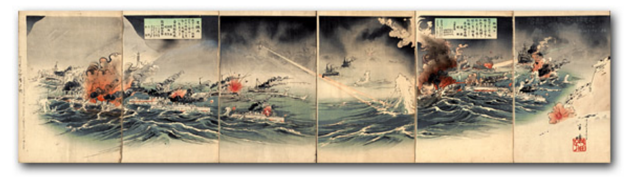
"Illustration of the Furious Battle of Japanese and Russian Torpedo Destroyers outside the Harbor of Port Arthur" by Yasuda Hampō, 1904

Hampō also produced an early hexaptych (six-block print) of "Japanese and Russian torpedo destroyers" engaged in "furious battle" in the opening clash outside Port Arthur.