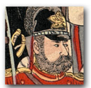
Details reveal how closely Japanese officers (right) resembled Russian officers (left).

"Illustration of Russian and Japanese Army and Navy Officers" by Watanabe Nobukazu, February 1904