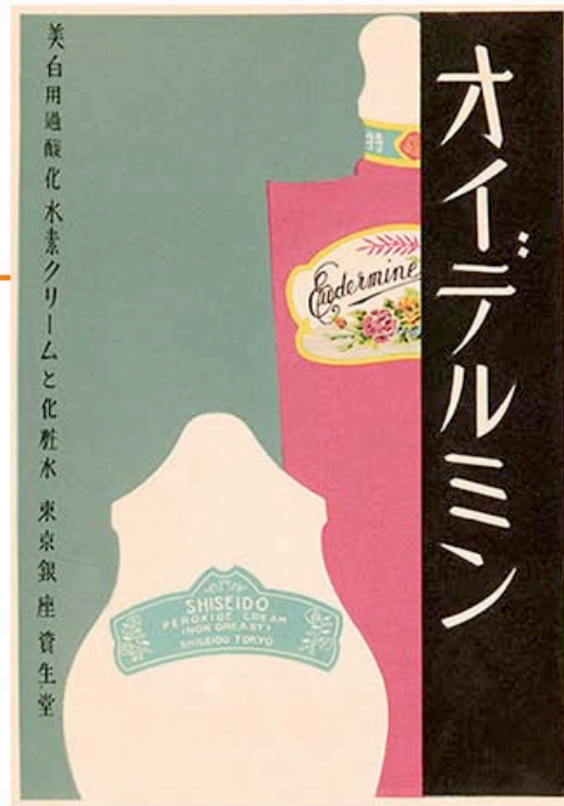
Eudermine and Peroxide Cream poster, 1925, by Yabe Sue