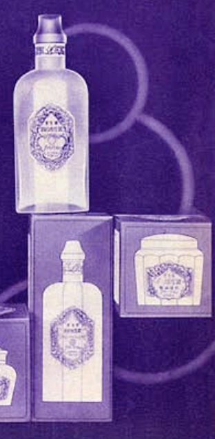
Bottles arranged in groups (left)

植物精液に酒精を加へた液から蒸して出た化粧水 植物油質で毛髪をよくと潤滑のホマード 自然の白くする特製のみろ水白粉とホマード 化粧にも化粧にも適するのまろくも白粉とホマード 湯洗後使用するのに適する固焼白粉とホマード ペンシヤクリームに少量の酒精を加へた皮膚の保湿と潤滑のクリーム