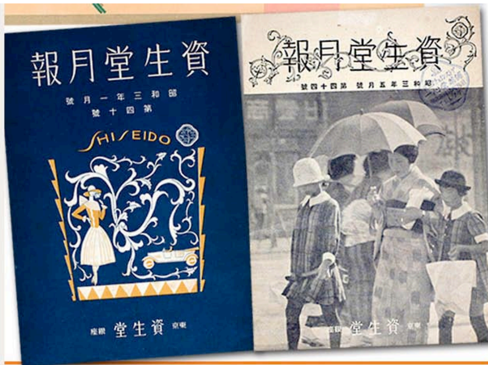
The arabesque style is woven into the cover image (left) and masthead (right) of Shiseido Geppō, Shiseido's customer magazine.

Shiseido Geppō 40 magazine cover, January 1928