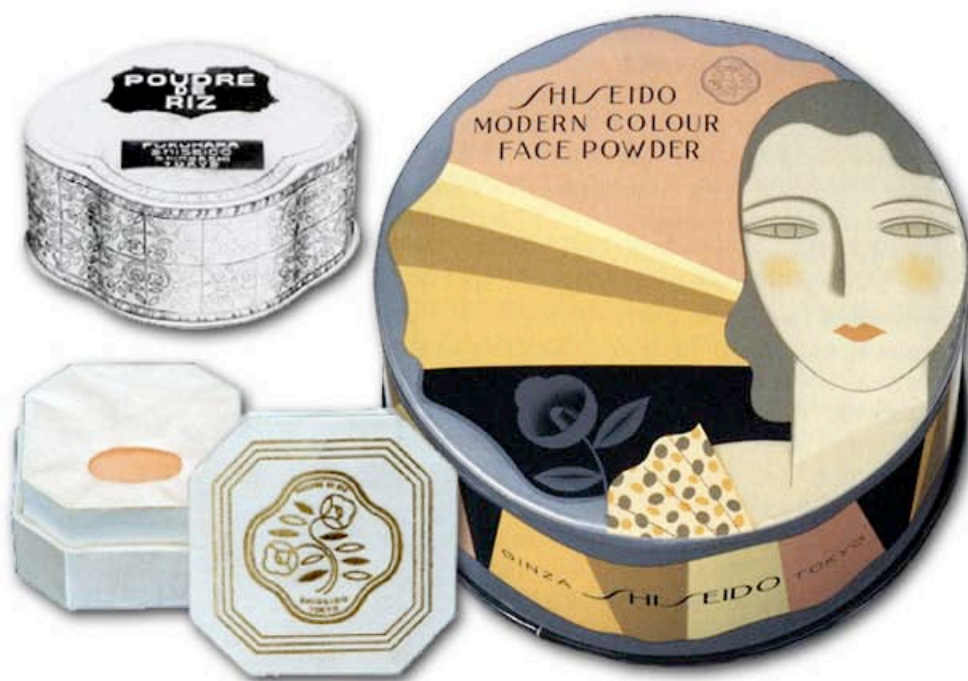
Poudre de Riz, 1917 Maeda Mitsugu, designer

The female entertainers (geisha) who worked in nearby Shinbashi and who were loyal Shiseido customers particularly liked the green and purple powder colors because they were thought to flatter the complexion under electric lighting. The powder packaging also diverged from the conventional round or cylindrical packages and used a tasteful octagonal container with the company trademark inlaid in gold that showed the nine leaves of the camellia blossom (see below). Gradually, as Japanese cosmetic practices changed over time and moved toward a greater naturalism, the traditional thick white cosmetic foundation ( o-shiroi ) ceased to be used for daily wear. 8