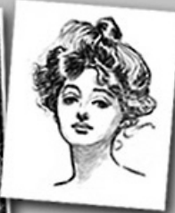
Gibson Girl, ca. 1900 by Charles Dana Gibson (near left)