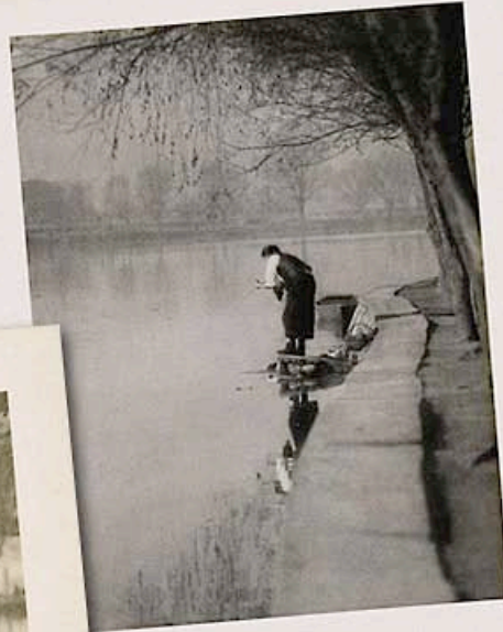
Photographs by Fukuhara Shinzo plates 1, 11, rotogravure edition from Beautiful West Lake: The Light with its Harmony, 1931

Shinzo is equally well-known in the history of Japanese photography for his pictorialist photography work and his role as founder of several highly influential photographic societies: Shashin Geijutsusha and the Nihon Shashinkai . 3 This photography work frequently graced the pages of the company's public relations publications like Shiseido Monthly ( Shiseido Geppō ).