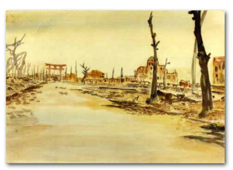
Downtown Hiroshima in ruins, as seen two weeks later.

Corpses lay everywhere. In many depictions by hibakusha , the dead are naked and bright red or coal black.