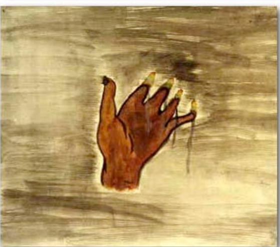
The hand of a corpse lifted toward heaven, fingers "burning with a blue flame."

YAMABE Shōji 42 years old in August 1945 [01_29] detail