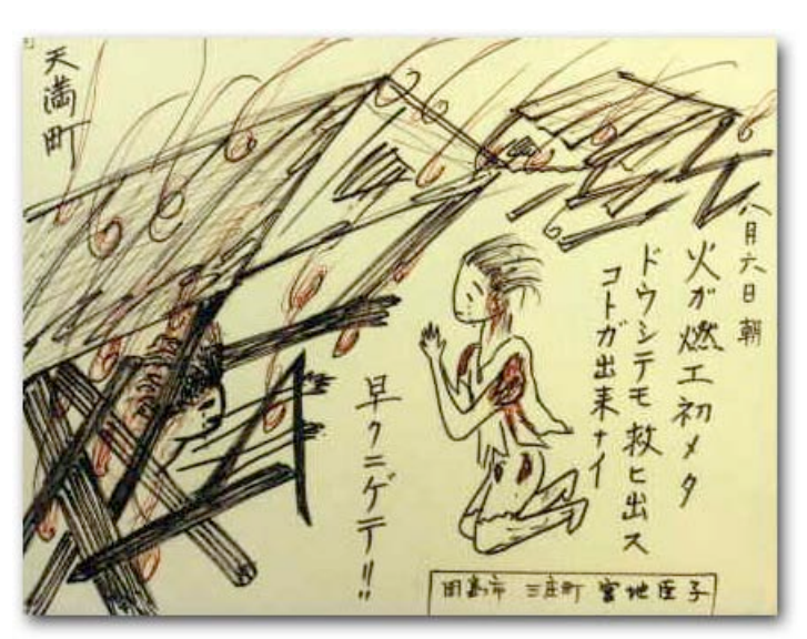
1,300 meters from the hypocenter, the artist begs forgiveness for being unable to save a stranger trapped under a collapsed building. "The flames began to rise. There was nothing I could do to help. 'Get away, hurry!' the person screamed at me."