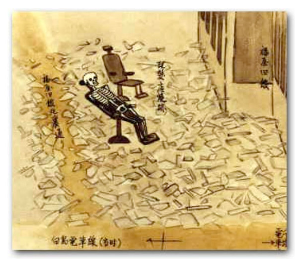
On August 12, six days after the bomb, the artist came upon a skeleton sitting in a still-intact tilted barber's chair.

Some pictures by survivors are striking by virtue of their singular grotesqueness. An injured man gazes at his own eyeball in the palm of his hand. A skeleton sits in an intact, still upright barbershop chair. A woman's hand rises out of the rubble, the fingers burning like candles. The charred corpse of a child lies on the ground (this a survivor's memory from three days after the Hiroshima bomb) with its arms reaching toward heaven.