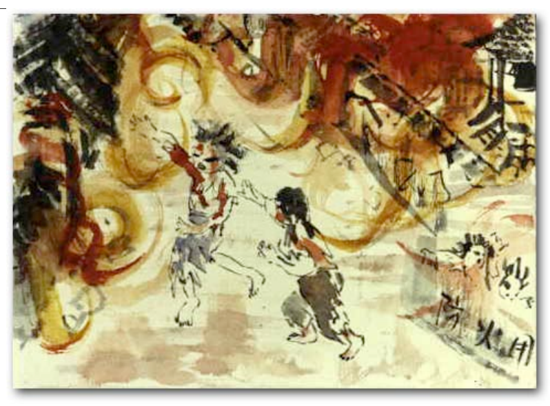
The artist and an injured girl attempting to escape "a sea of flames."

On viewing images of a potentially disturbing nature: click here.